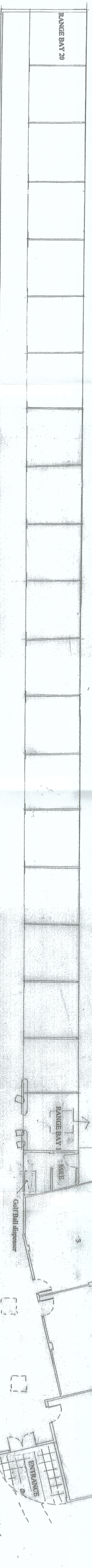
PROPOSED FLOOR PLAN