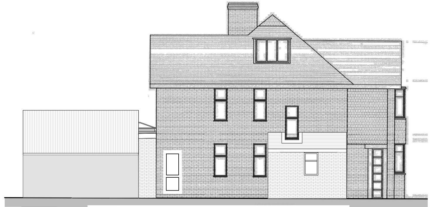
Proposed NE Side Elevation