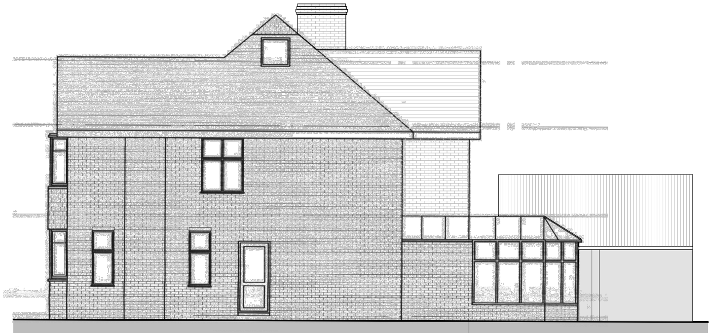
Existing SW Side Elevation