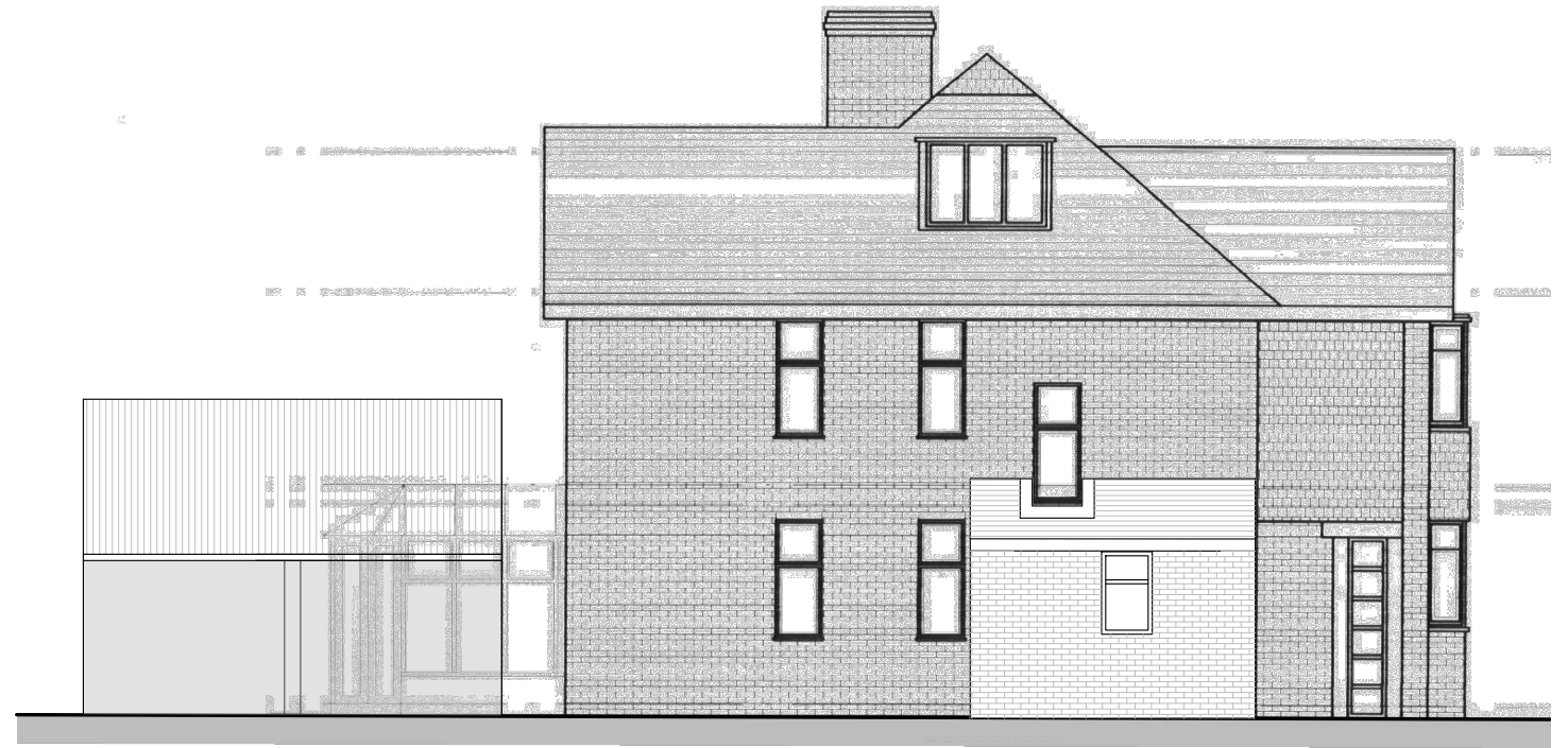
Existing NE Side Elevation