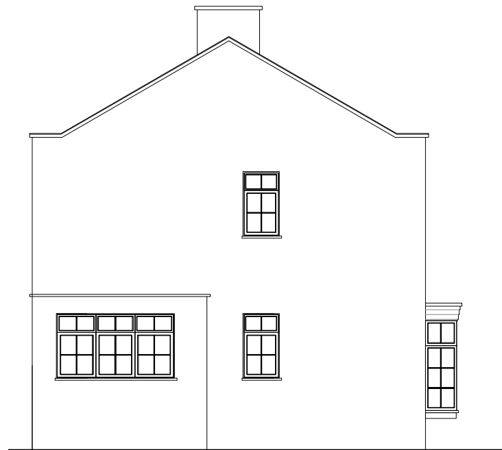
3 EXISTING SIDE ELEVATION 08 SCALE 1:100 @A3