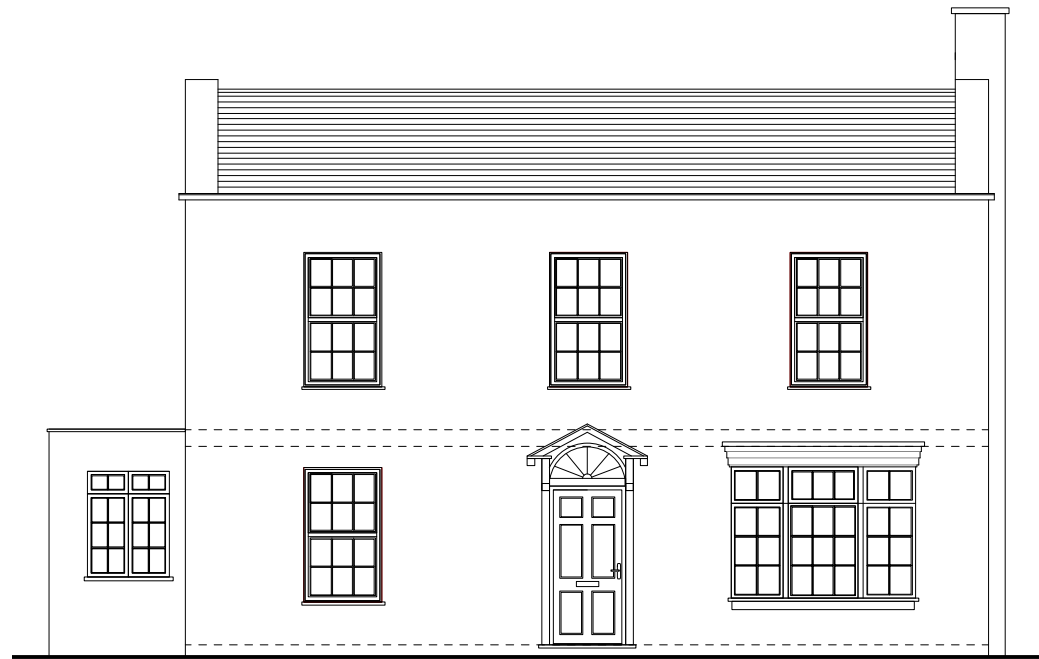
1 EXISTING FRONT ELEVATION 08 SCALE 1:100 @A3