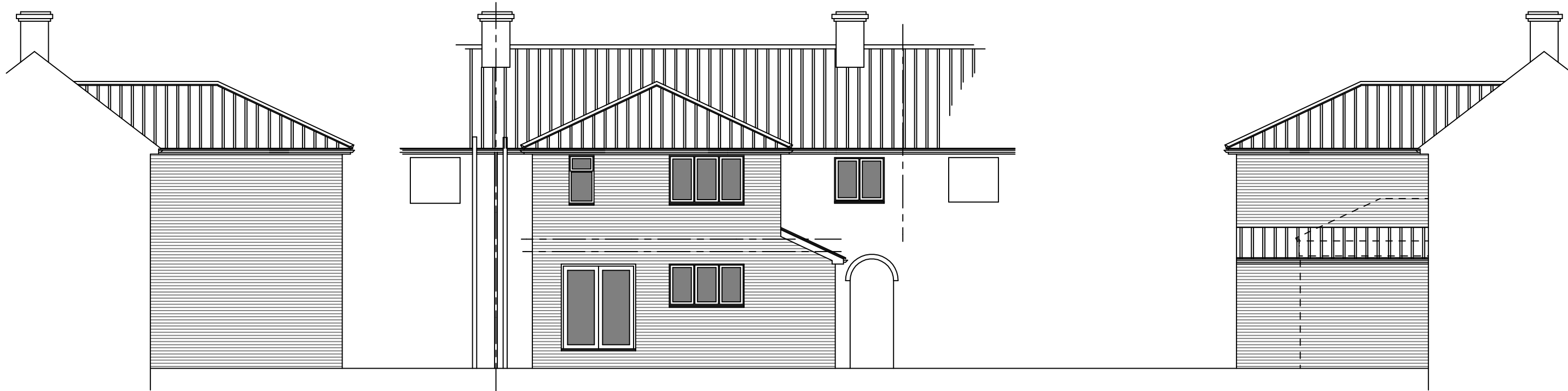
Proposed L.H. Side Elevation ( scale 1:100@A3 )