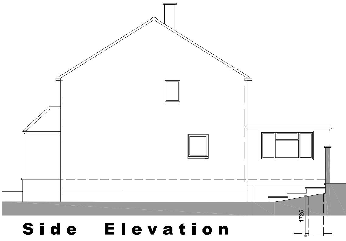
Side Elevation Existing