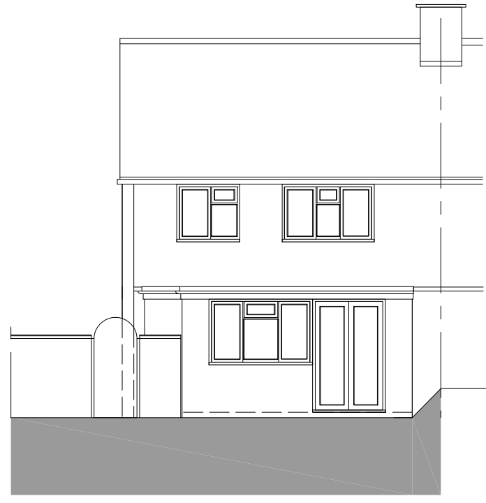
Rear Elevation Existing