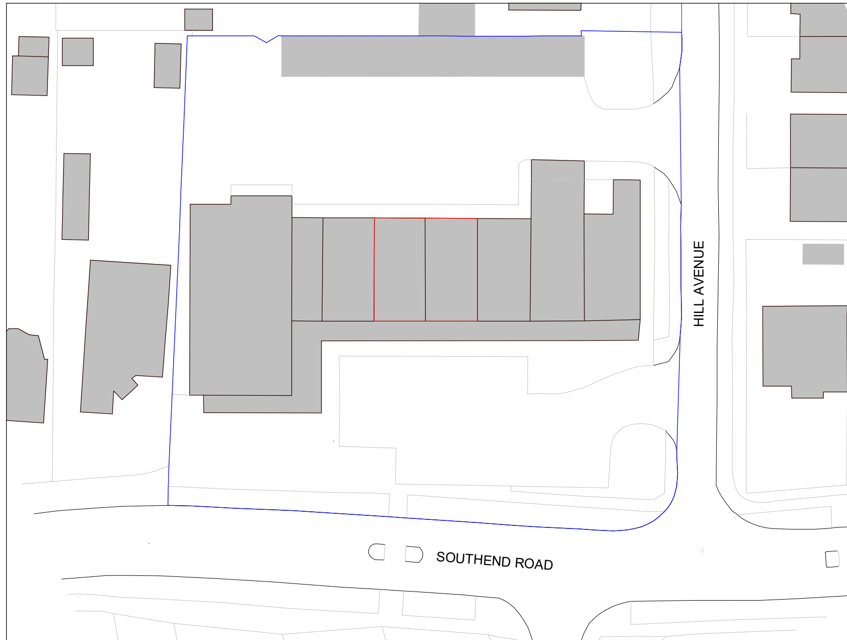
1. Site - Block Plan 1 : 500