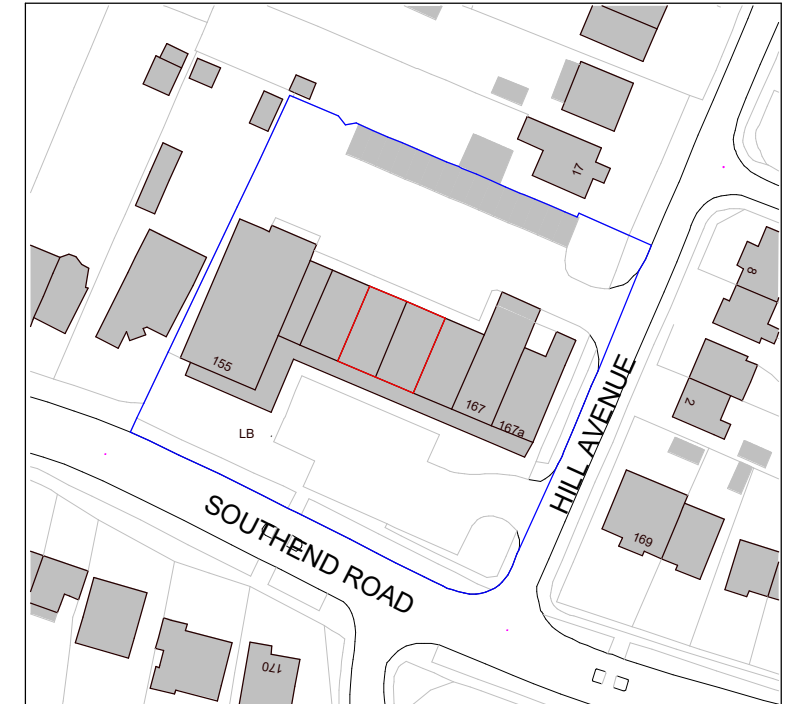
2. Site - Location Plan