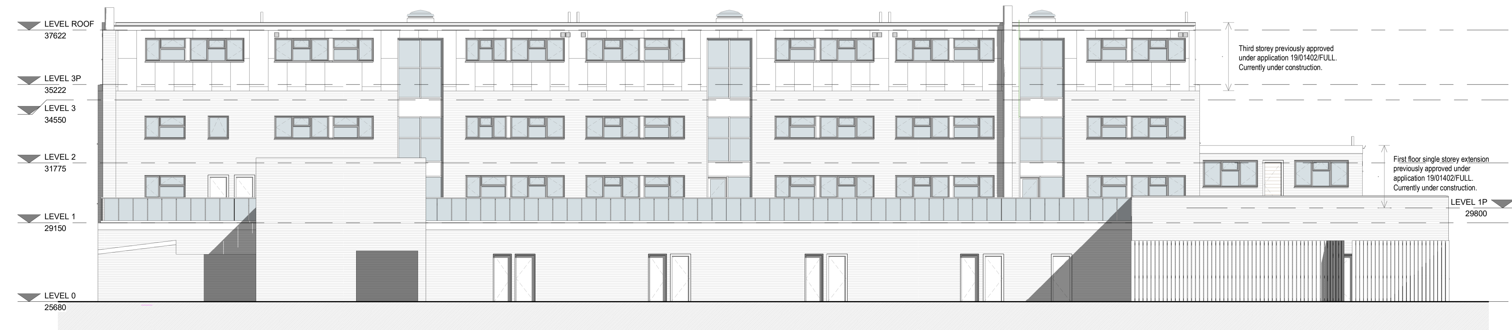
4. Rear - Proposed 1:100