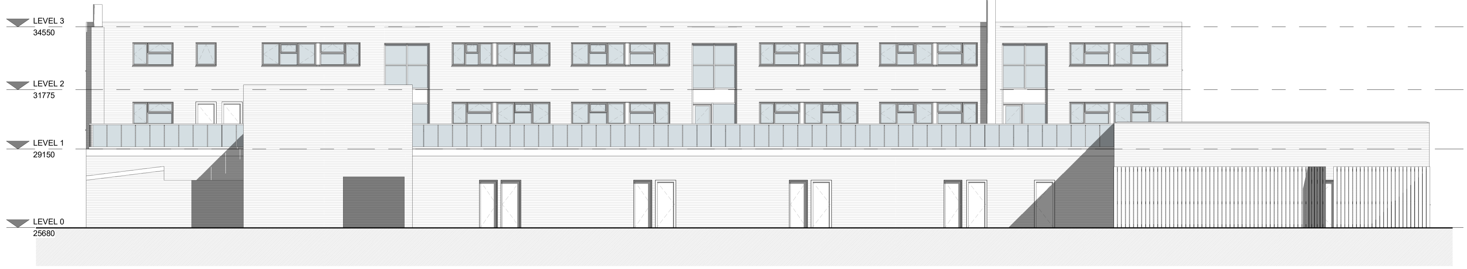
4. Rear - Existing 1:100