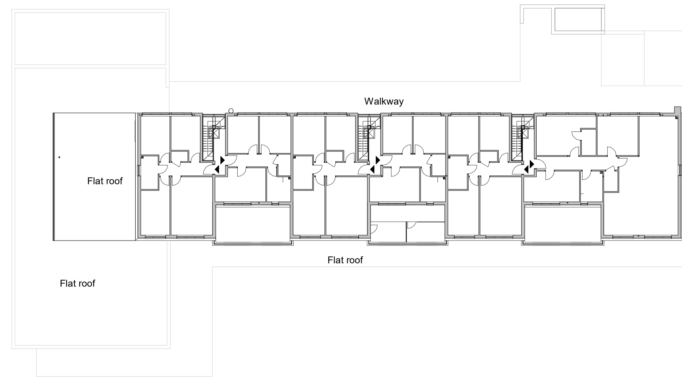
3. Level 3P - GA Proposed 1:200