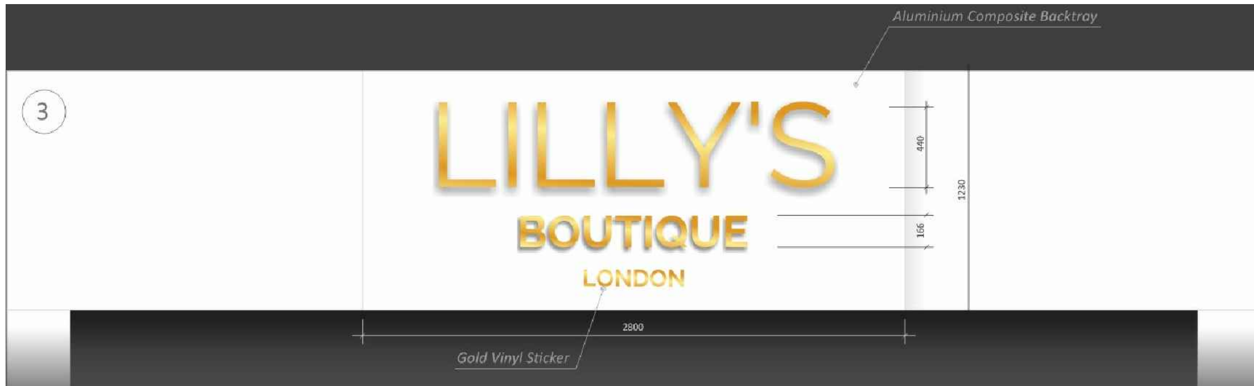
PROPOSED DETAILS (1:20 SCALE)

1. Scale this drawing for Planning Purposes only 2. Do not scale for working drawings all dimensions shall be checked on site prior to commencing the works and any errors or admissions reported to the Architect 3. This drawing is the copyright of POQ Architects and must not be used or reproduced without their permission