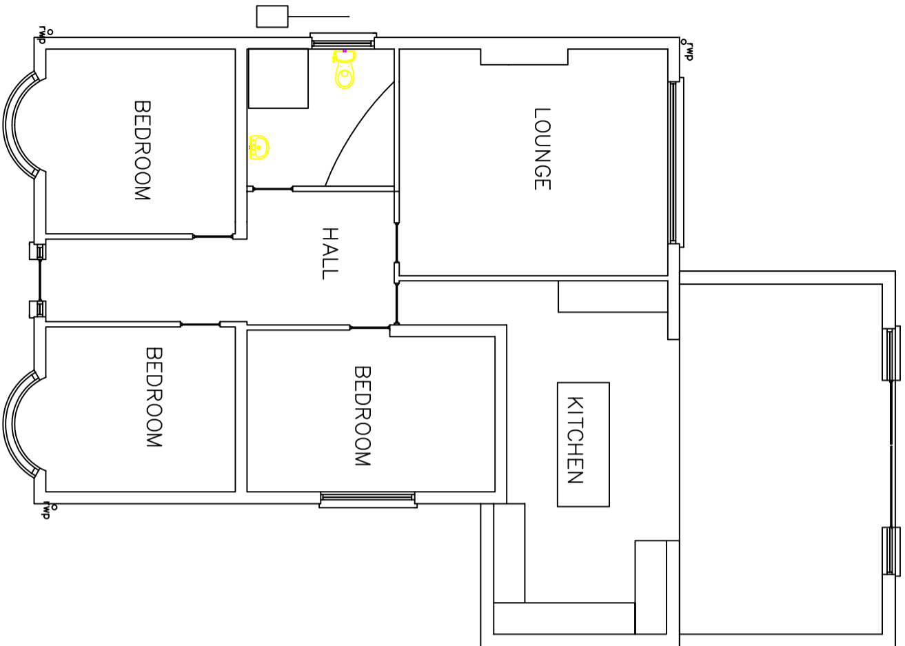
EXISTING GROUND FLOOR LAYOUT