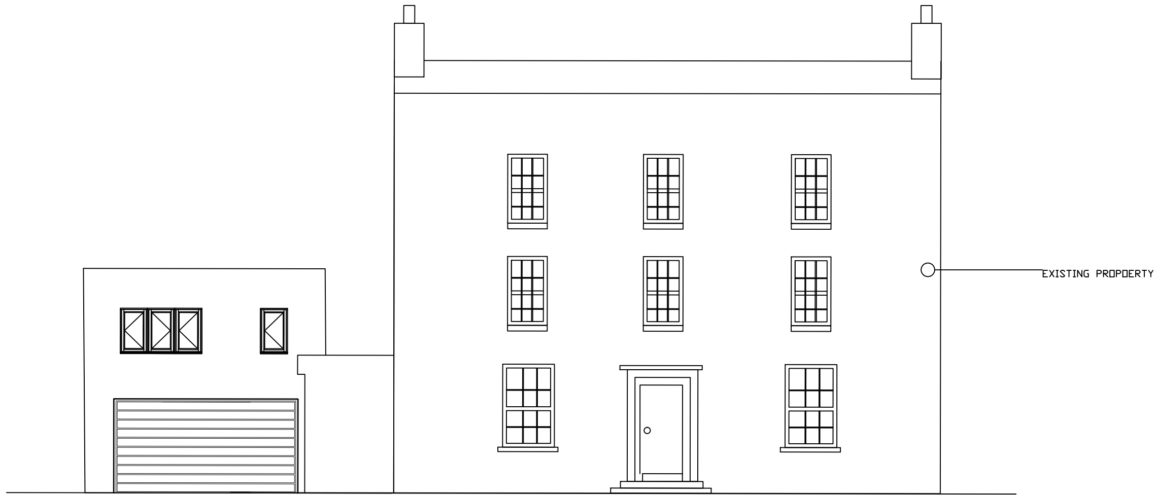
PROPOSED EXTENSION FRONT ELEVATION - 1 : 100