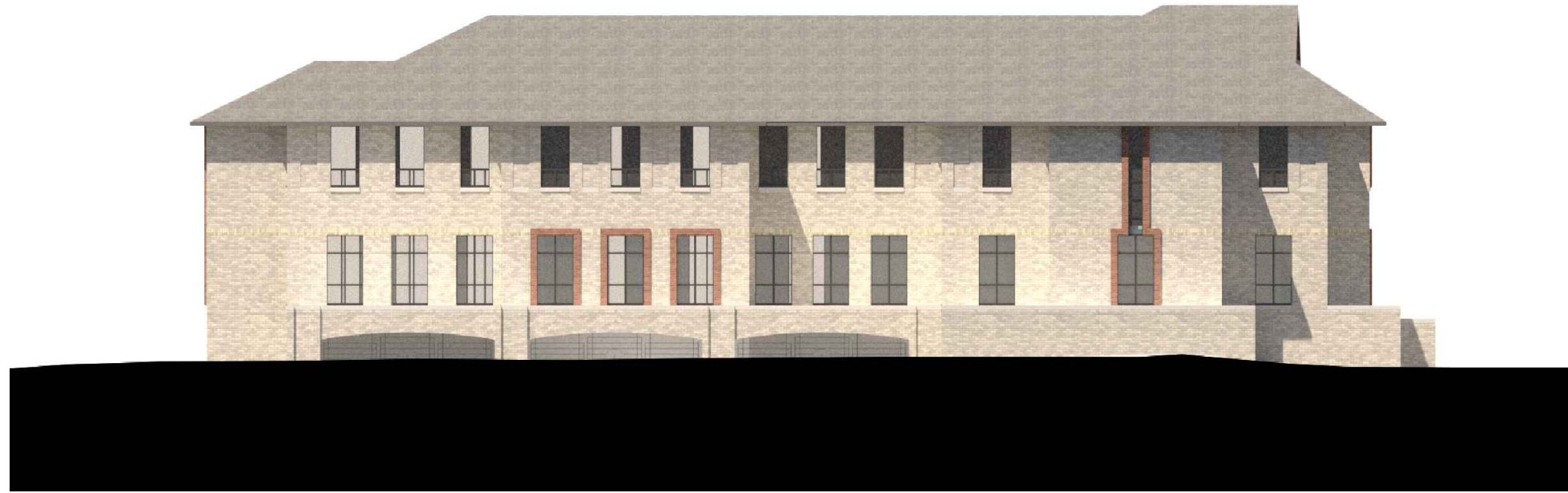
3 EXISTING SOUTH-EAST ELEVATION EX.AL.310 SCALE 1:200 @ A3