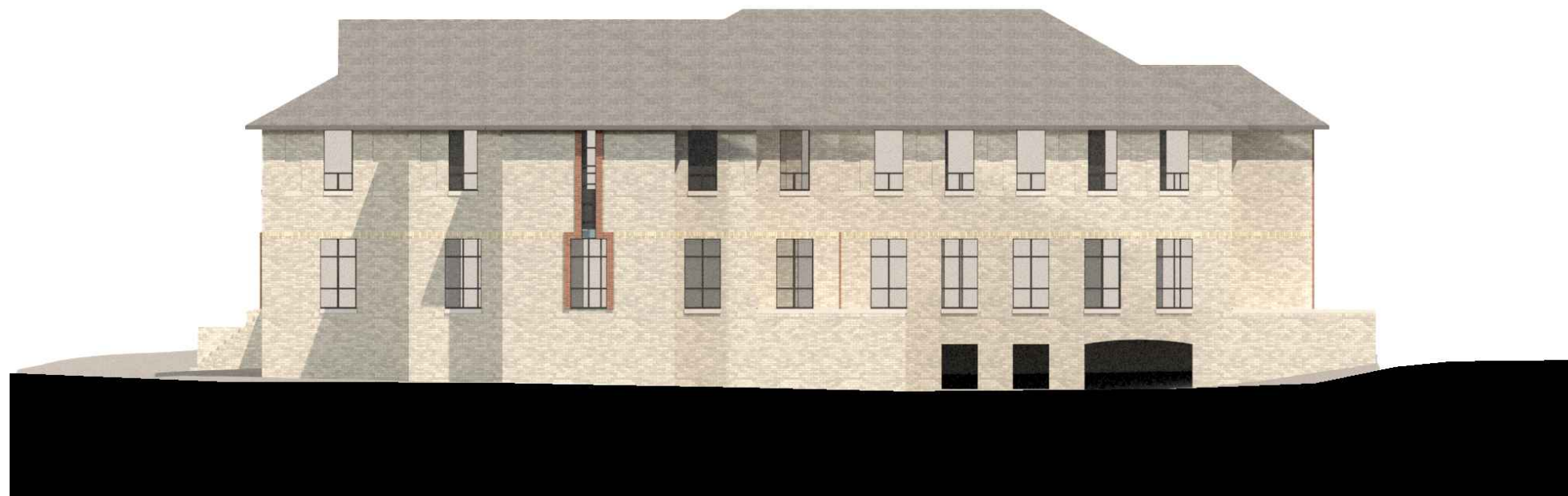
4 EXISTING SOUTH-WEST ELEVATION EX.AL.310 SCALE 1:200 @ A3