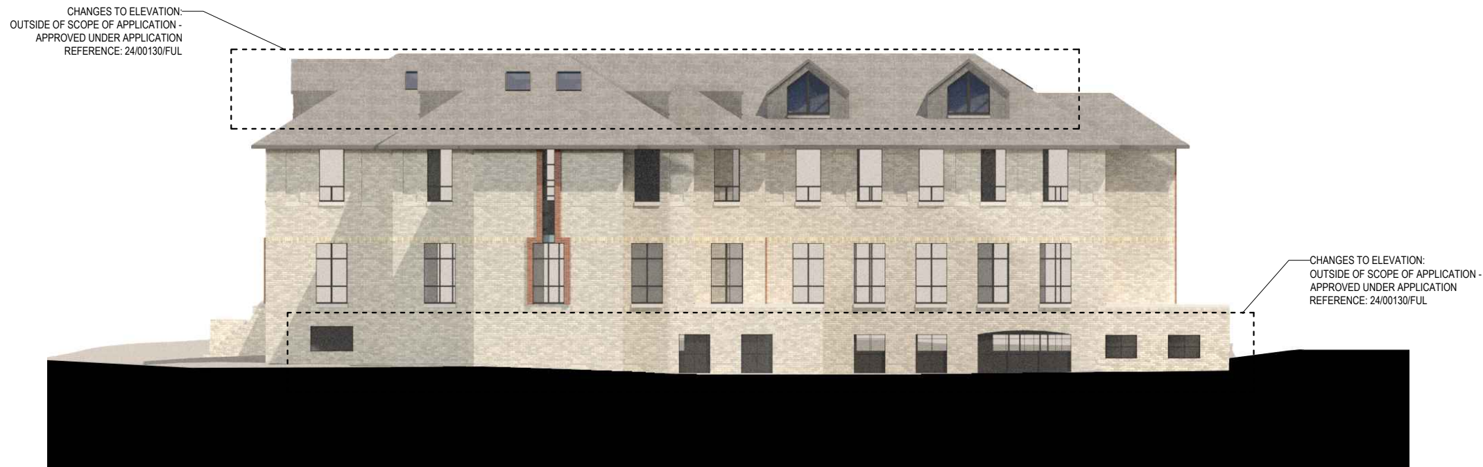
4 PROPOSED SOUTH-WEST ELEVATION PR.AL.310 SCALE 1:200 @ A3