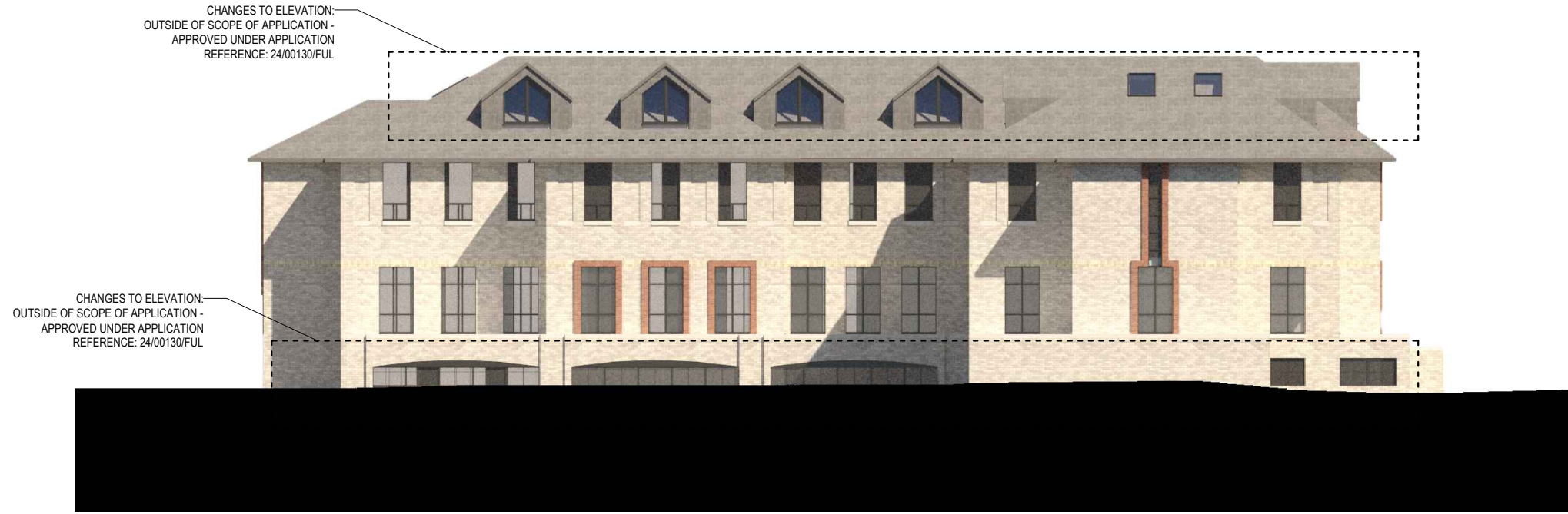
3 PROPOSED SOUTH-EAST ELEVATION PR.AL.310 SCALE 1:200 @ A3