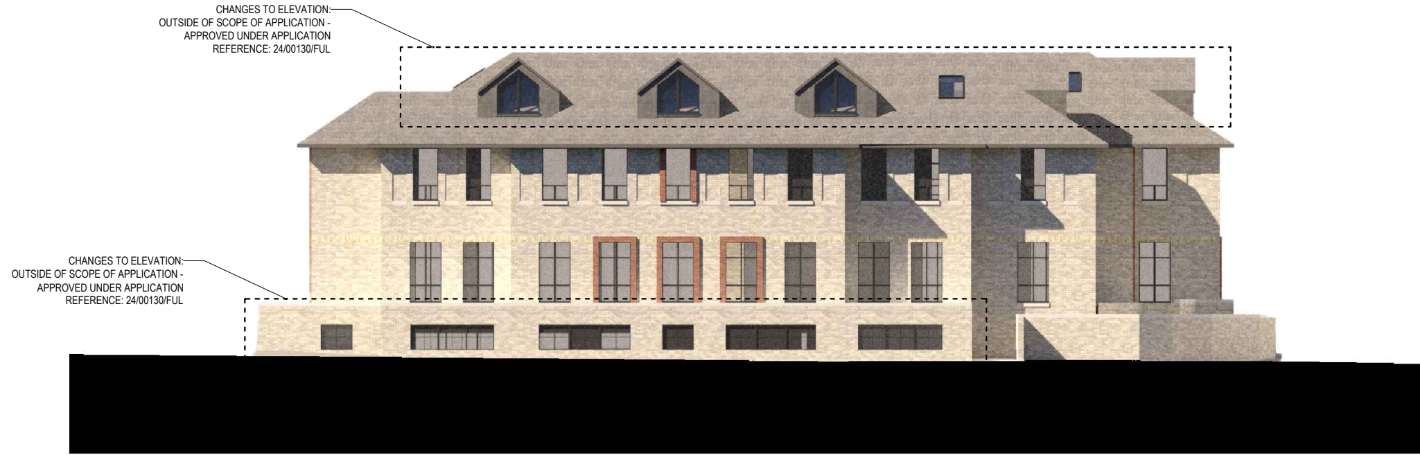
1 PROPOSED NORTH-EAST ELEVATION PR.AL.300 SCALE 1:200 @ A3