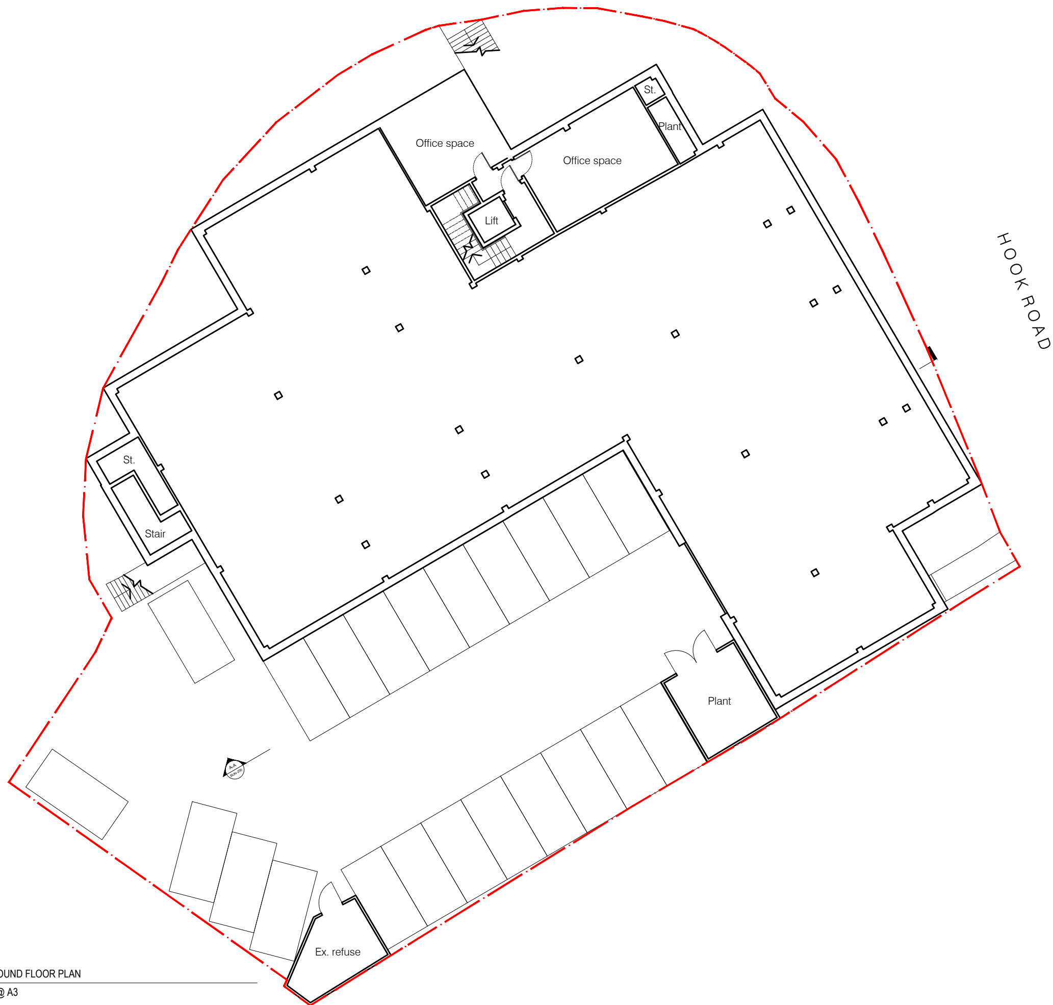
1 EXISTING GROUND FLOOR PLAN EX.AL.090 SCALE 1:200 @ A3