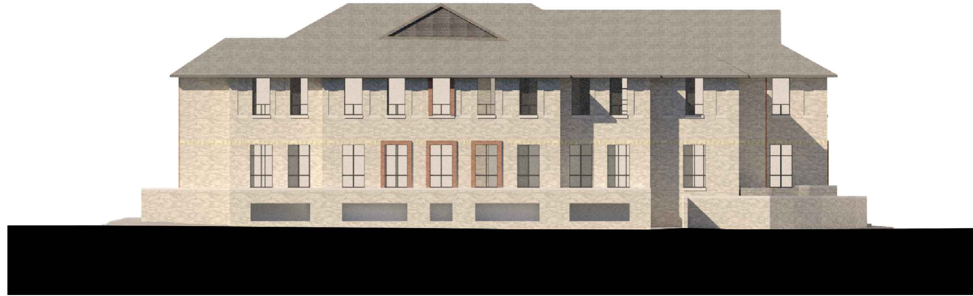
1 EXISTING NORTH-EAST ELEVATION EX.AL.300 SCALE 1:200 @ A3