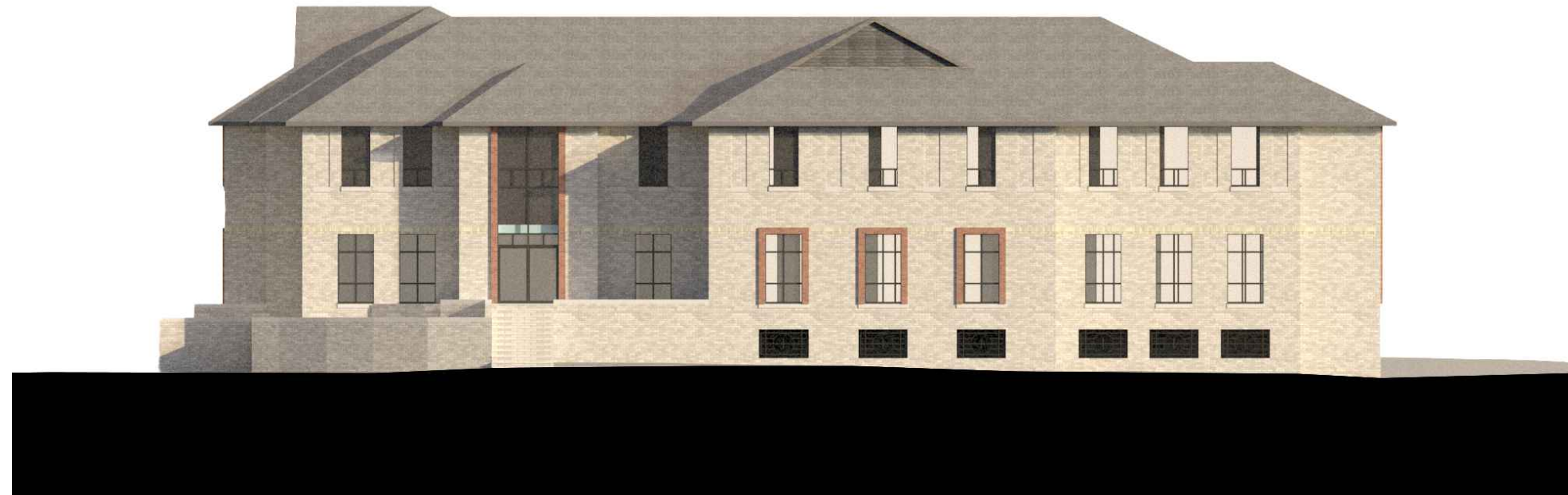
2 EXISTING NORTH-WEST ELEVATION EX.AL.300 SCALE 1:200 @ A3