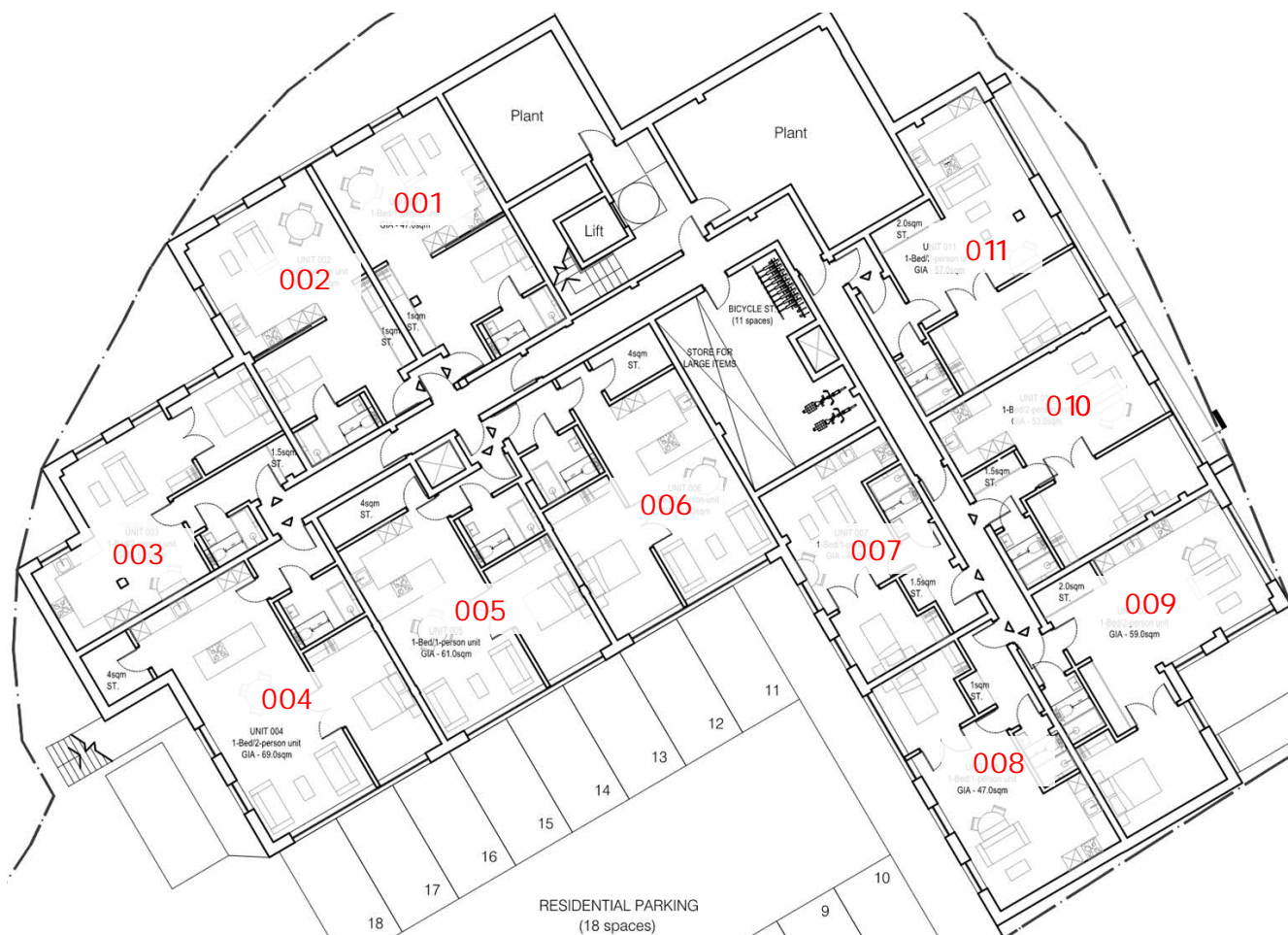
Basement Floor as Proposed