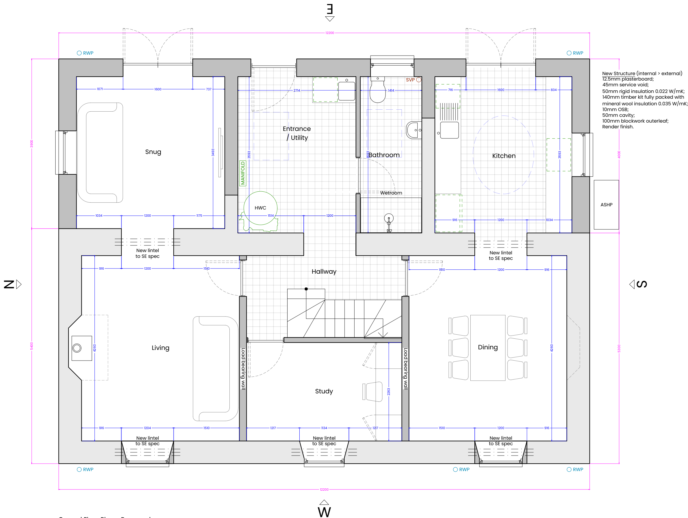
Ground Floor Plan - Proposed 1:50