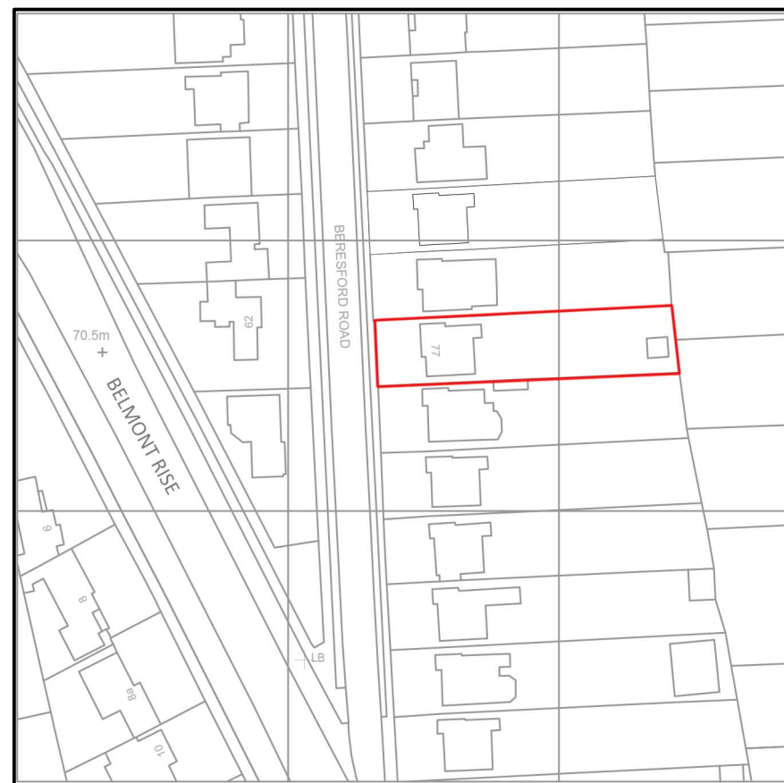
SITE LOCATION PLAN Scale: 1:1250