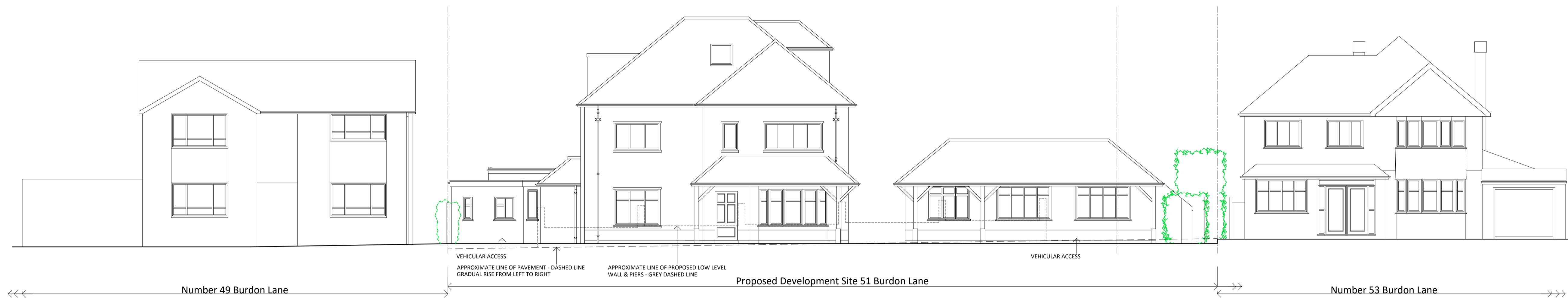
Proposed Front Context Street Elevation - South West - Onto Burdon Lane - 1:100 Scale