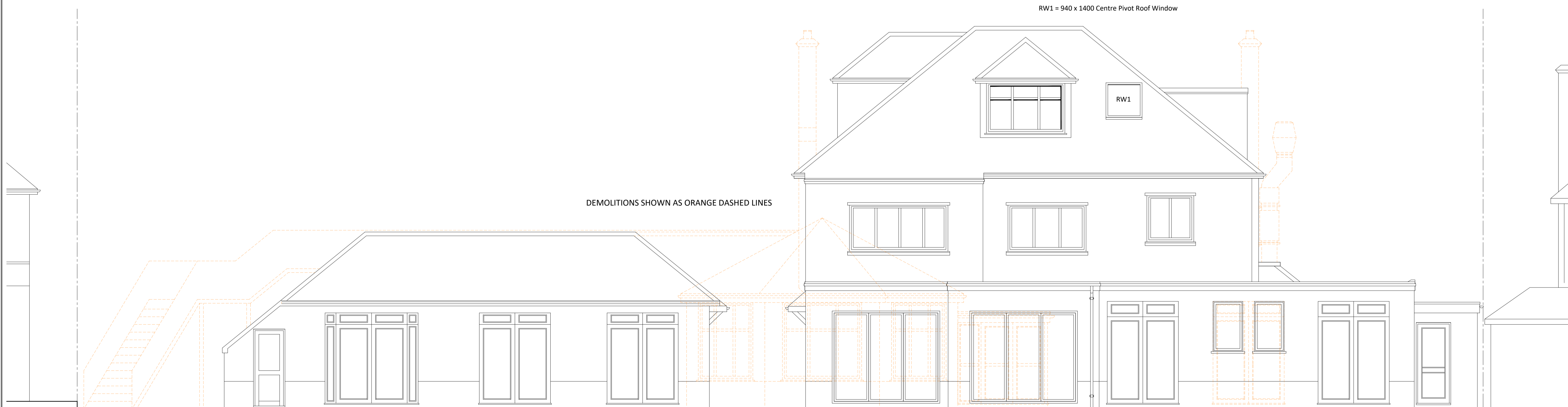
Proposed Rear Elevation - North East 1:50 Scale