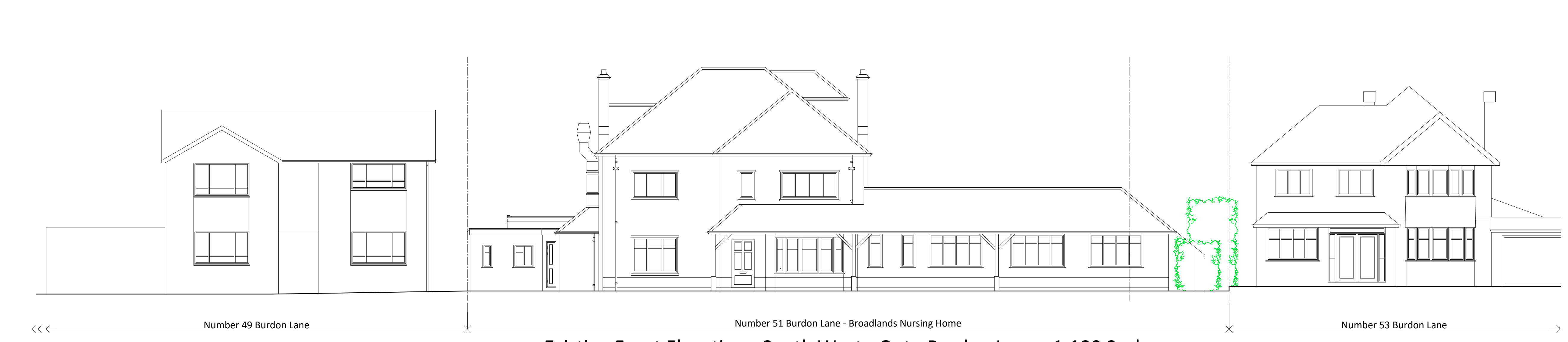
Existing Front Elevation - South West - Onto Burdon Lane - 1:100 Scale