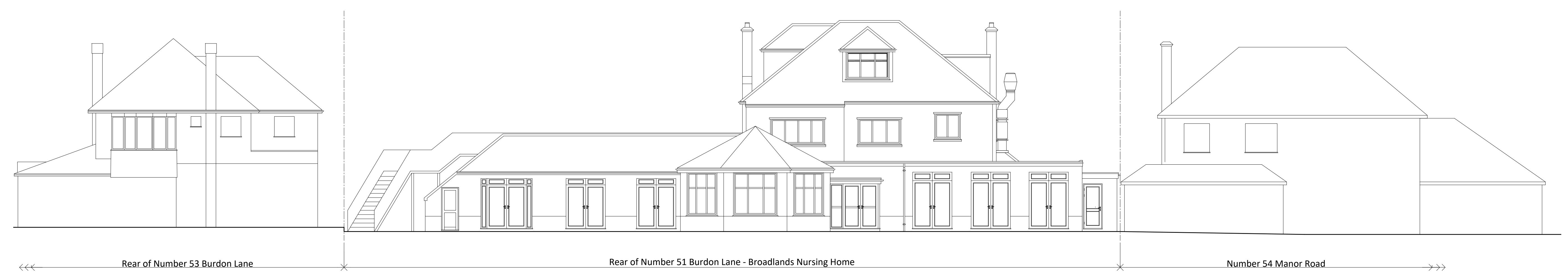
Existing Rear Elevation - North East - Onto Manor Road - 1:100 Scale