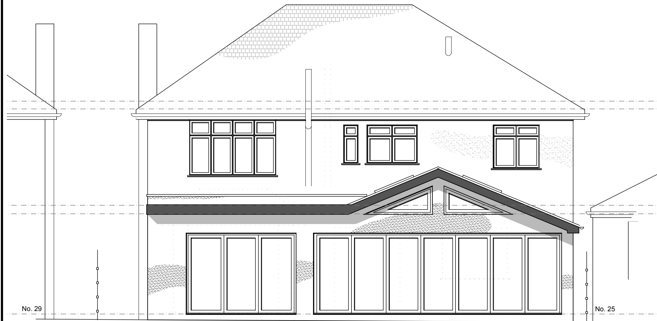
EAST REAR ELEVATION (view from 28 Cornwall Road)