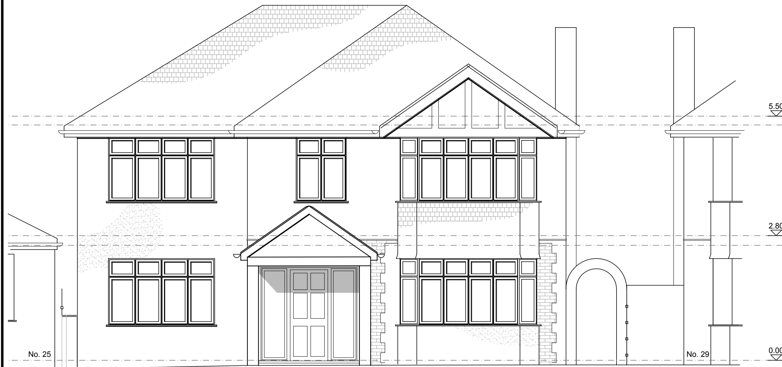
WEST FRONT ELEVATION (view from Beresford Road)