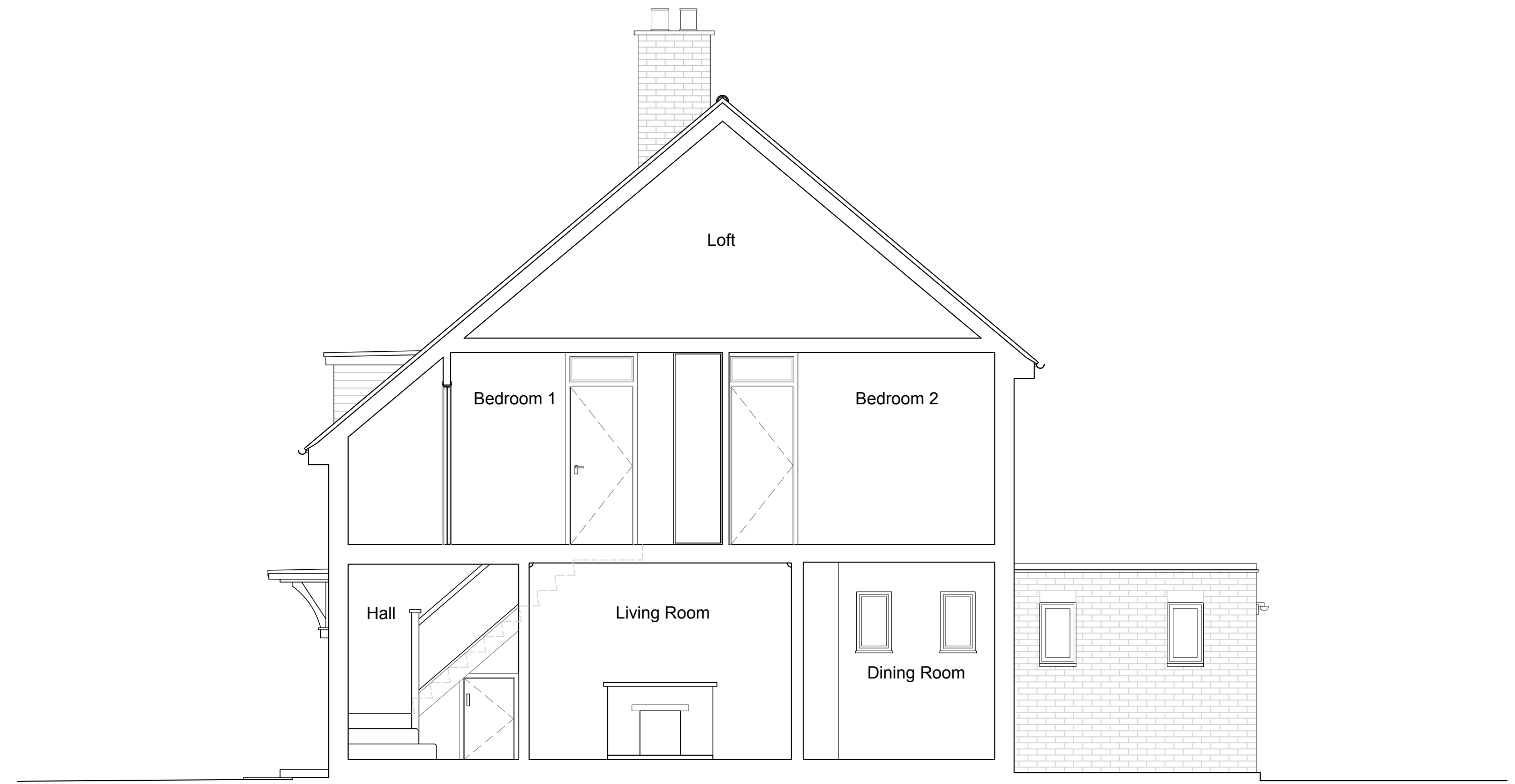
Existing Section AA Scale 1:100 @ A3 | 1:50 @ A1