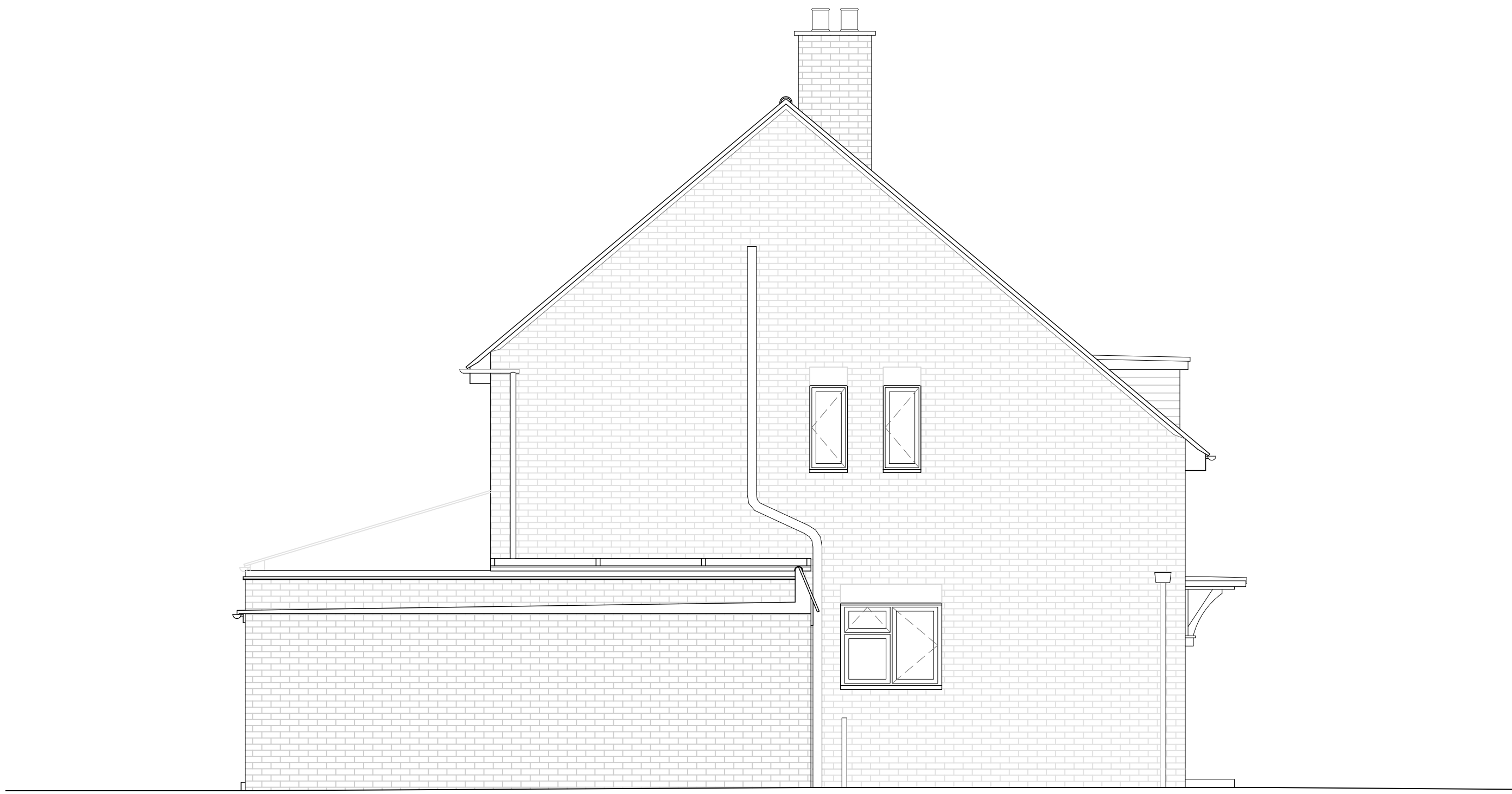
Existing Side (East) Elevation Scale 1:100 @ A3 | 1:50 @ A1