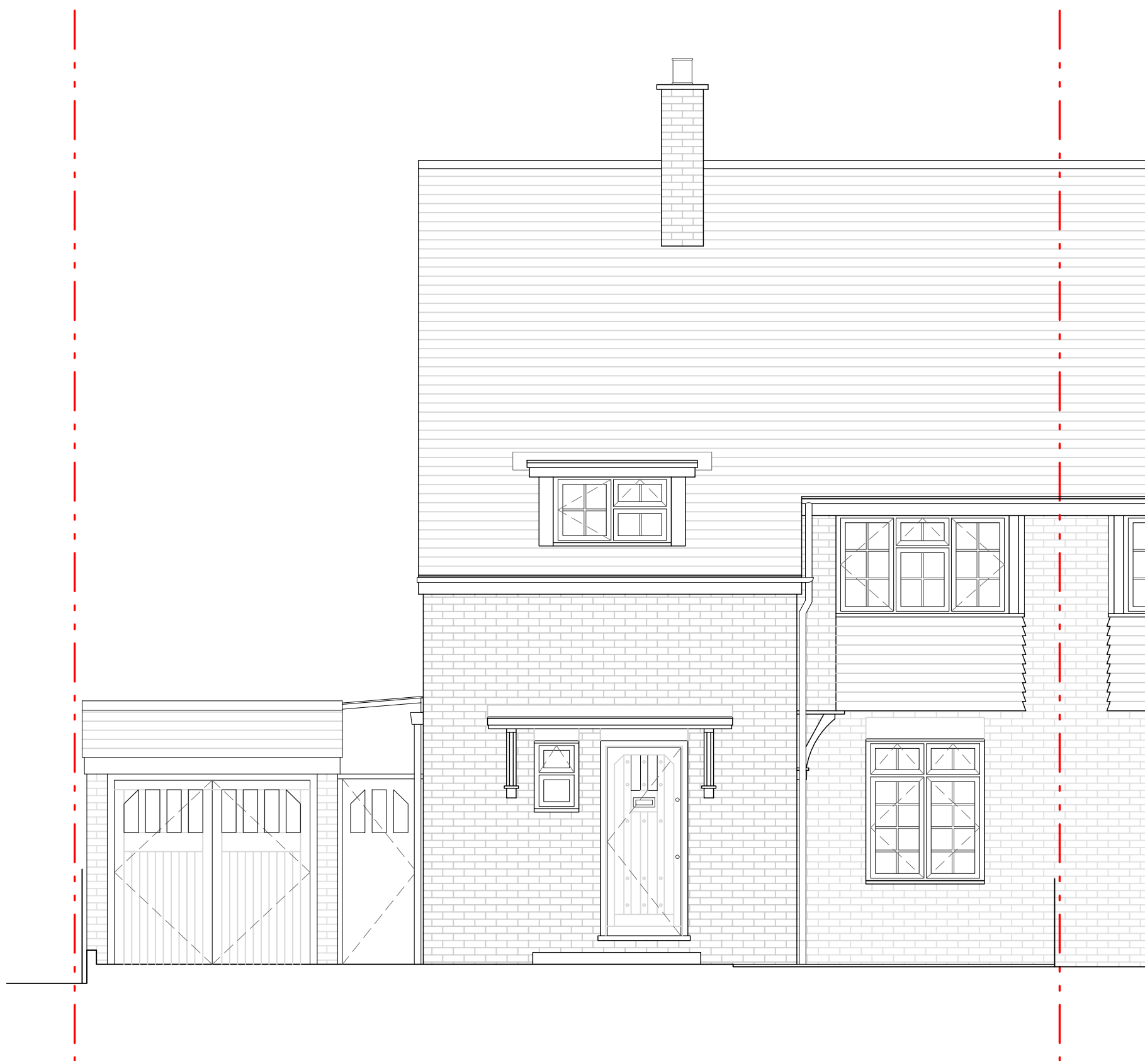
Existing Front (North) Elevation Scale 1:100 @ A3 | 1:50 @ A1