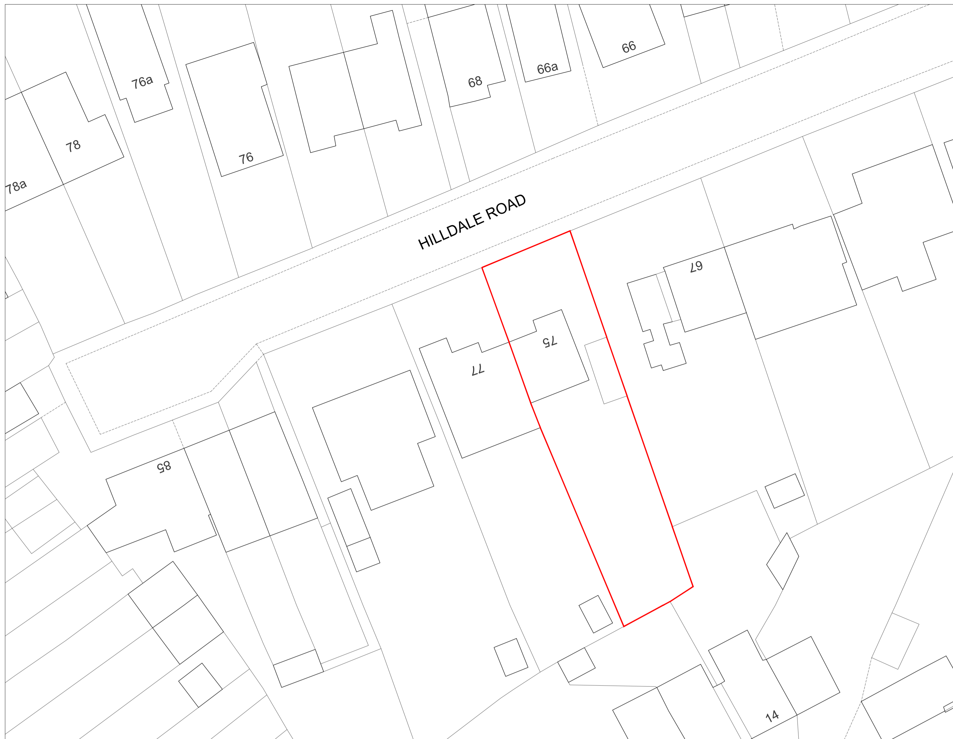
Existing Block Plan 1:500 @ A3 | 1:250 @ A1 0 5m 10m 15m 20m