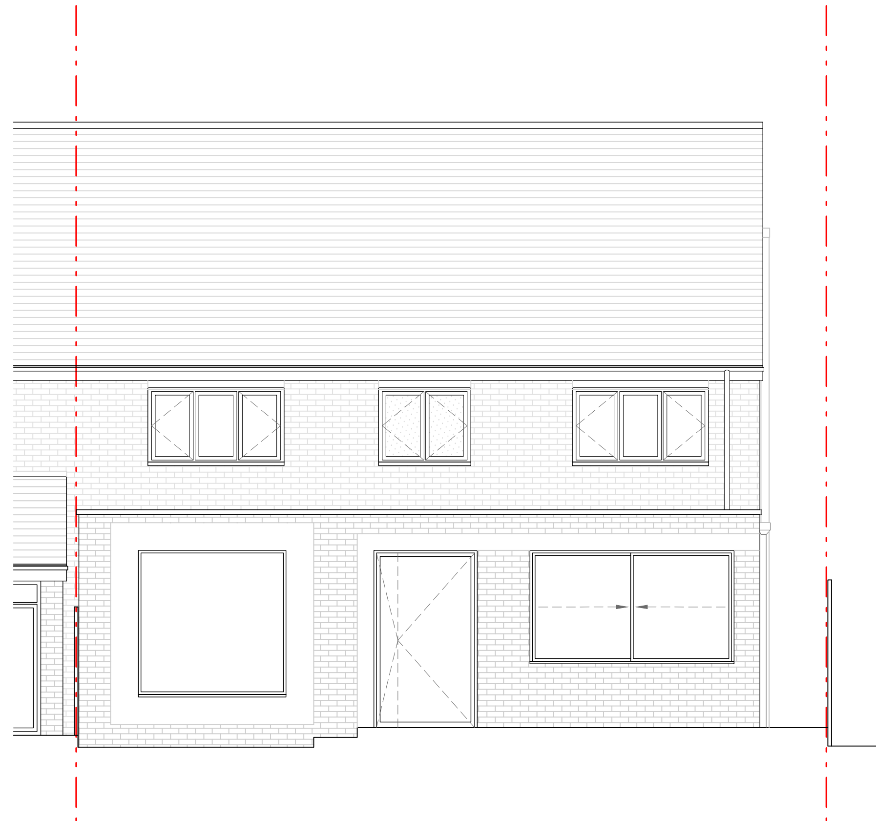
Proposed Rear (South) Elevation Scale 1:100 @ A3 | 1:50 @ A1