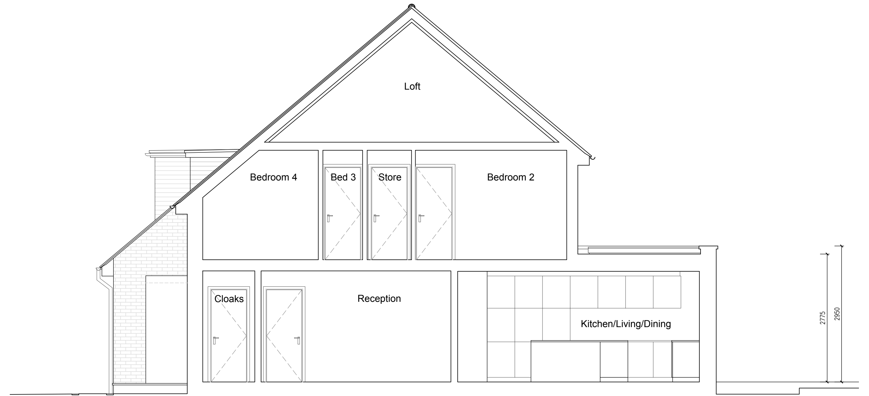
Proposed Section AA Scale 1:100 @ A3 | 1:50 @ A1