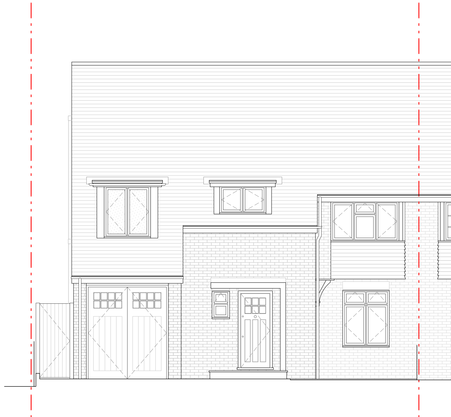
Proposed Front (North) Elevation Scale 1:100 @ A3 | 1:50 @ A1