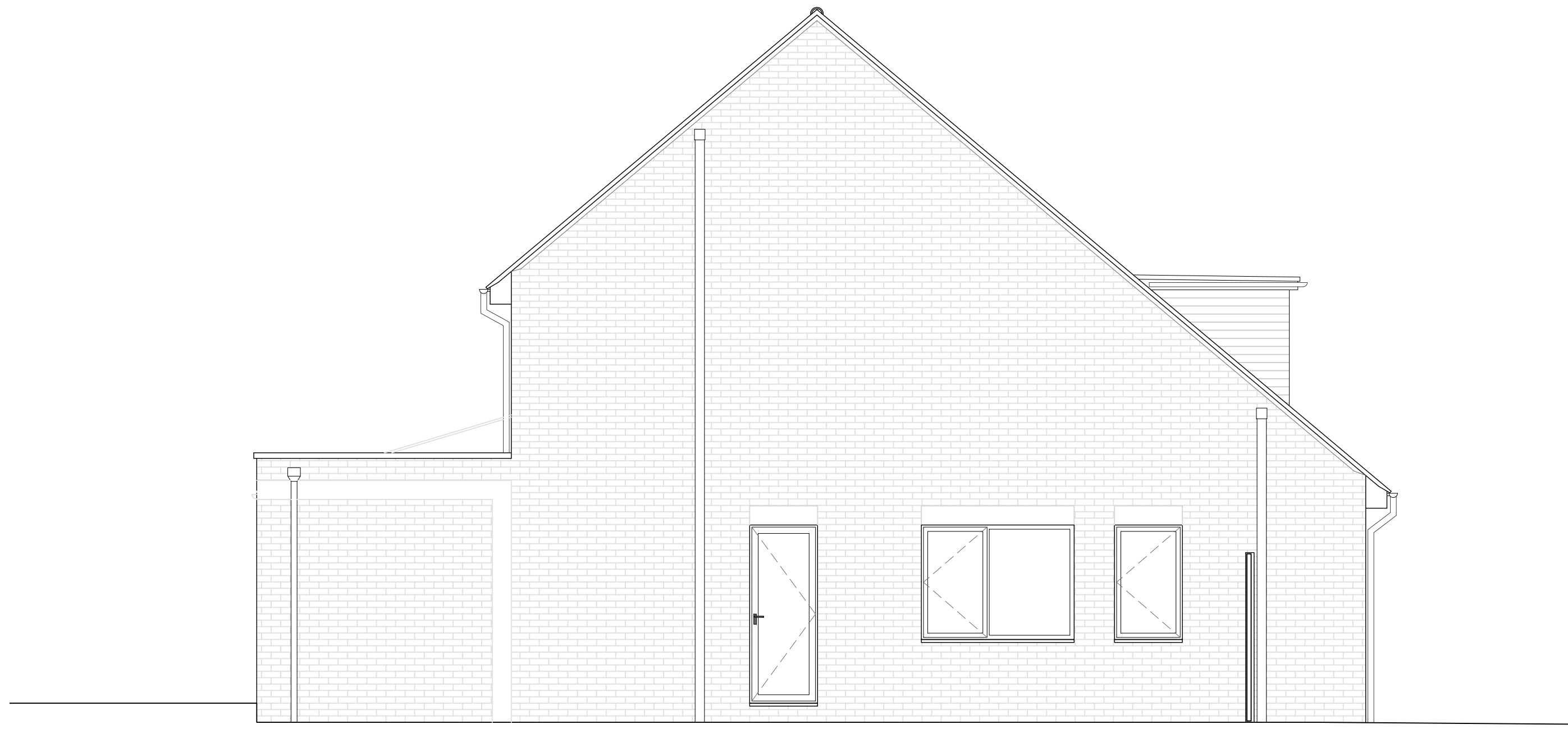
Proposed Side (East) Elevation Scale 1:100 @ A3 | 1:50 @ A1