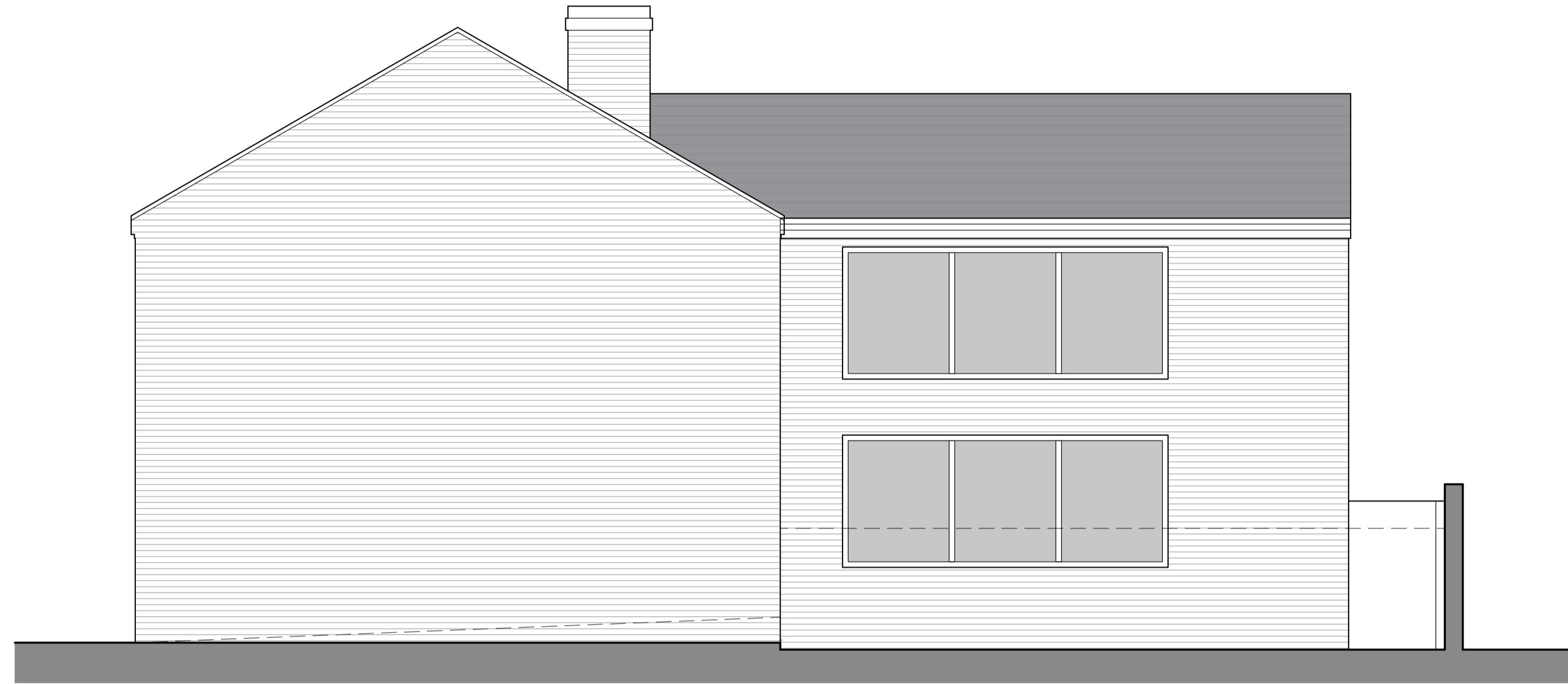
Side Elevation: 1:50 at A1