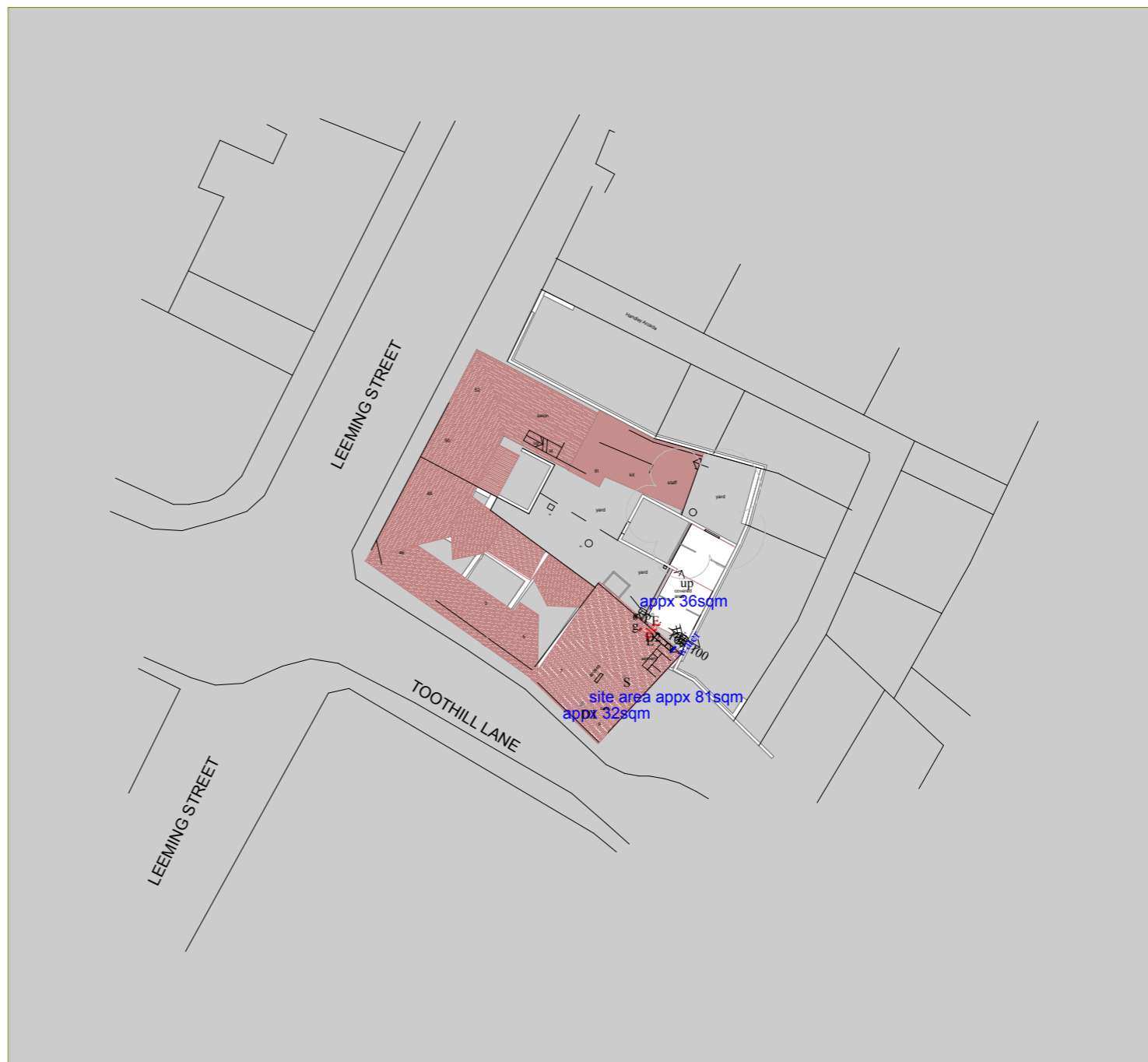
2 Block Plan 1:500