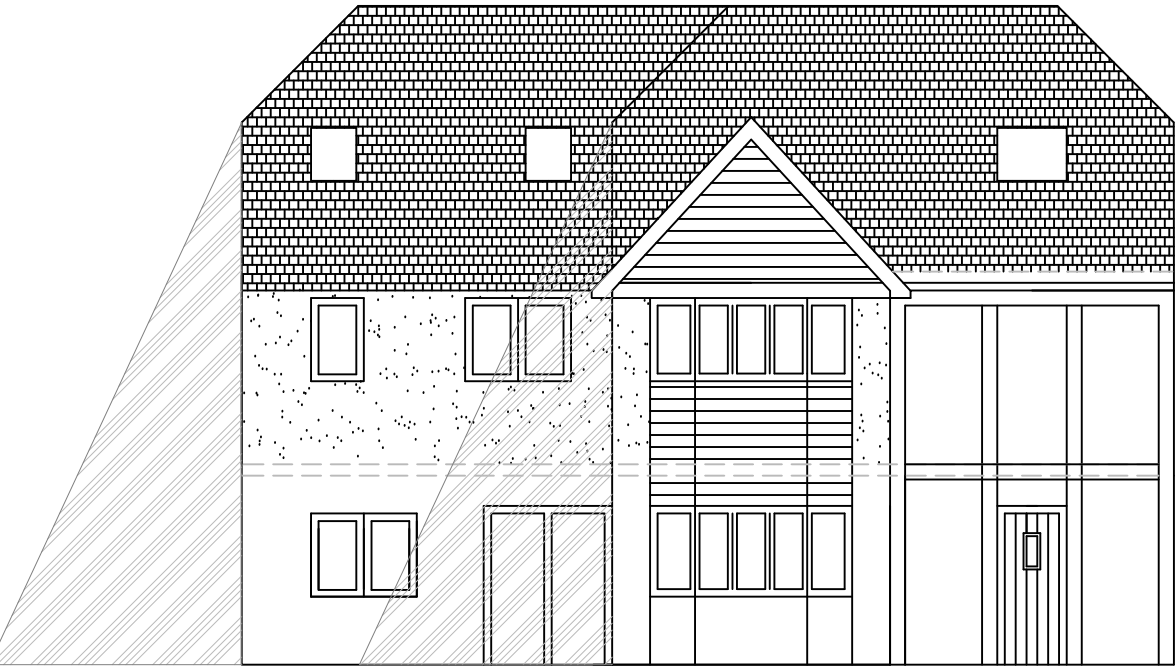
Front (Lichfield Lane elevation)