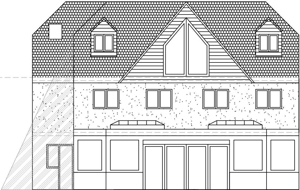
Rear (garden elevation)