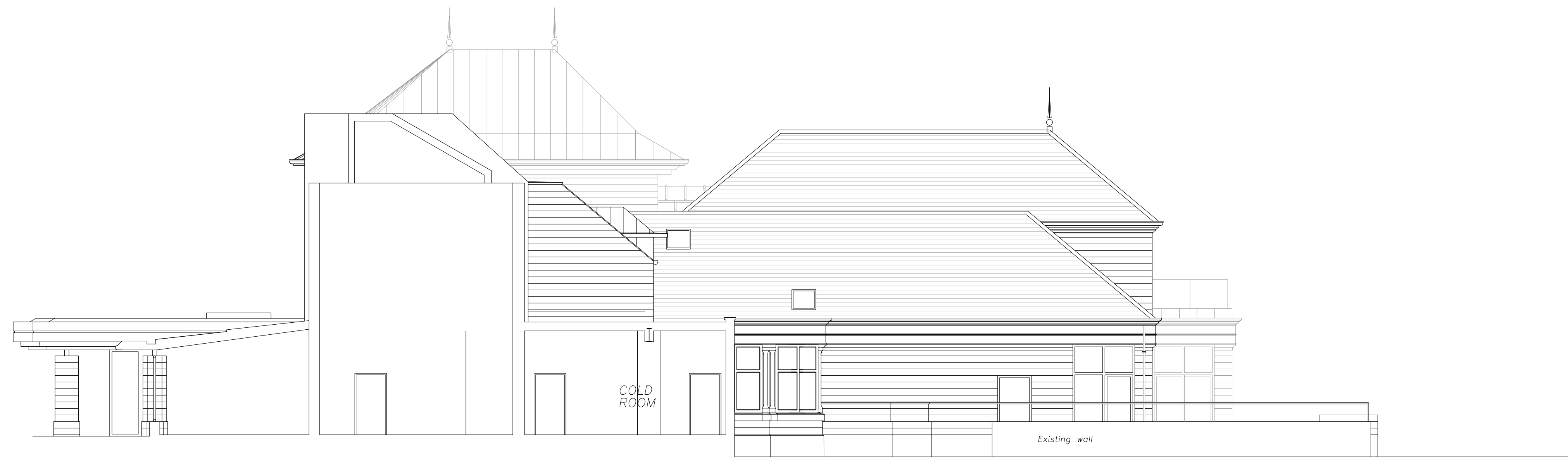
PART EXISTING SECTIONAL NORTH ELEVATION