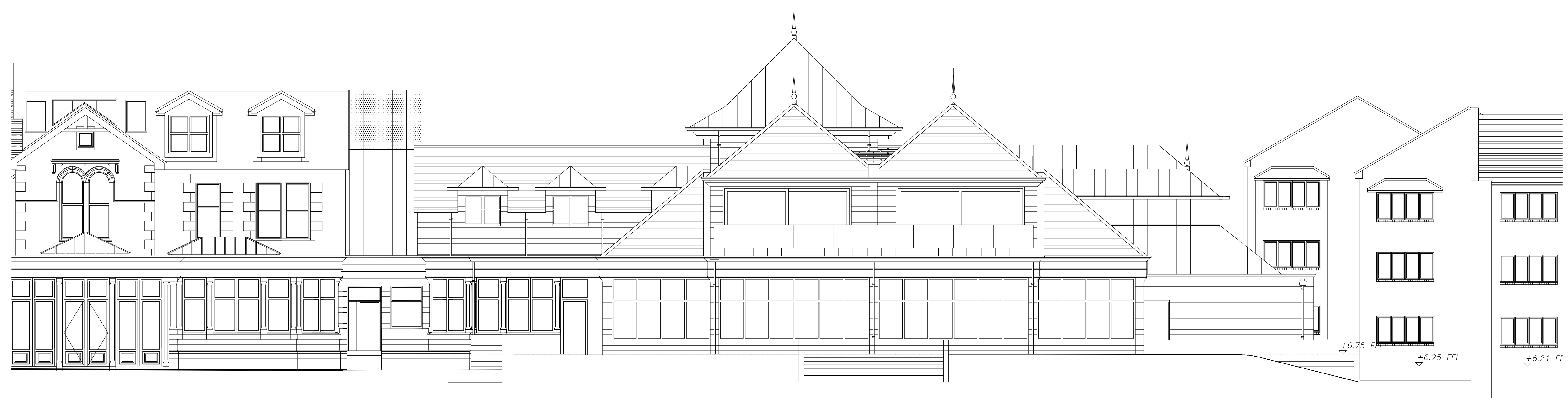
PART EXISTING WEST ELEVATION

This drawing has been prepared with the sole purpose of obtaining statutory Planning Consent and Building Warrant Approval from the local authority and is for information purposes only. Do not scale from this drawing. Refer to dimensions provided. Should additional dimensions be required contact BD Architectural Services. Contractor to check all dimensions on-site prior to commencement of works. Contractor to report any discrepancies on-site to BD Architectural Services during construction. This drawing is the property of BD Architectural Services. Should further copies be required please contact.