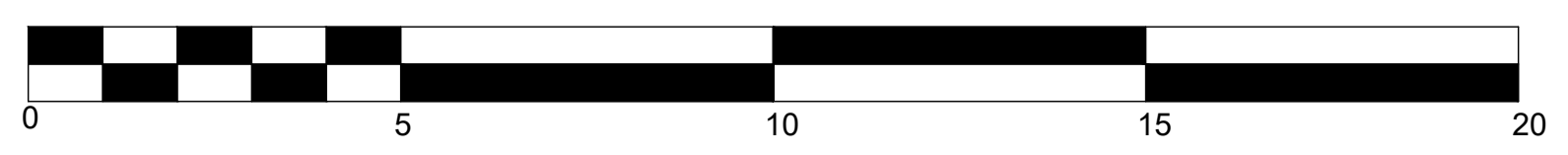
SCALE BAR 1:100