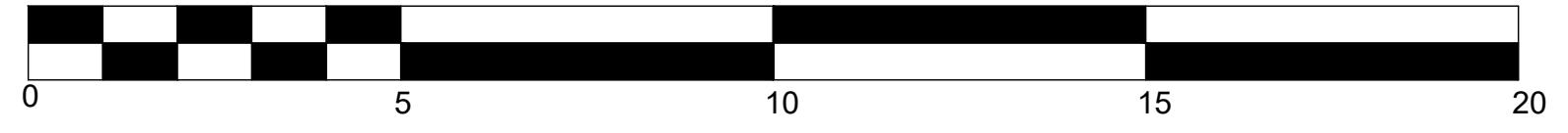
SCALE BAR 1:100