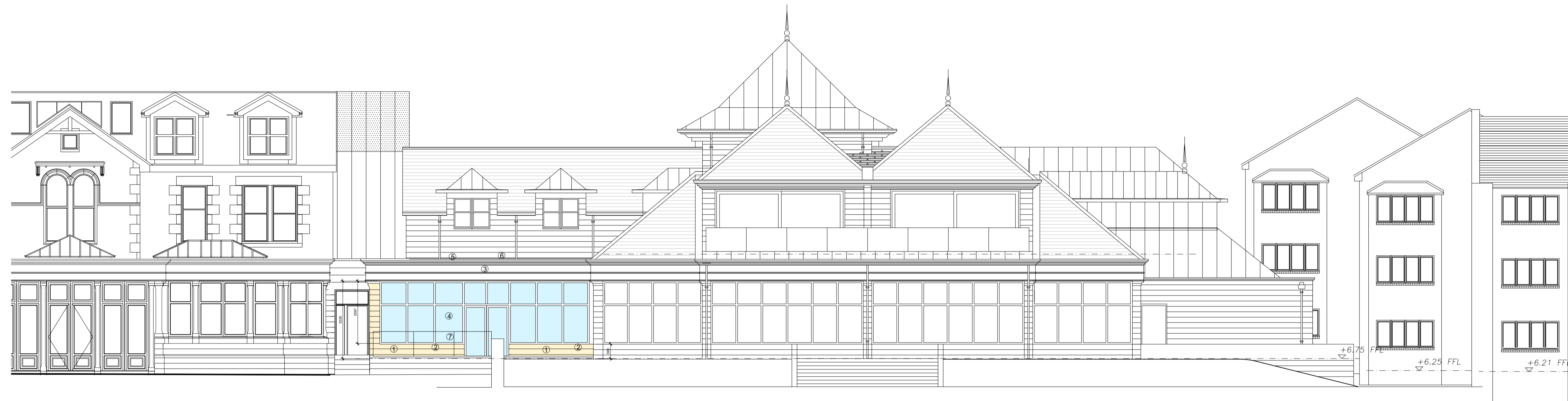
EAST PROPOSED WEST ELEVATION

This drawing has been prepared with the sole purpose of obtaining statutory Planning Consent and Building Warrant Approval from the local authority and is for information purposes only. Do not scale from this drawing. Refer to dimensions provided. Should additional dimensions be required contact BD Architectural Services. Contractor to check all dimensions on-site prior to commencement of works. Contractor to report any discrepancies on-site to BD Architectural Services during construction. This drawing is the property of BD Architectural Services. Should further copies be required please contact.