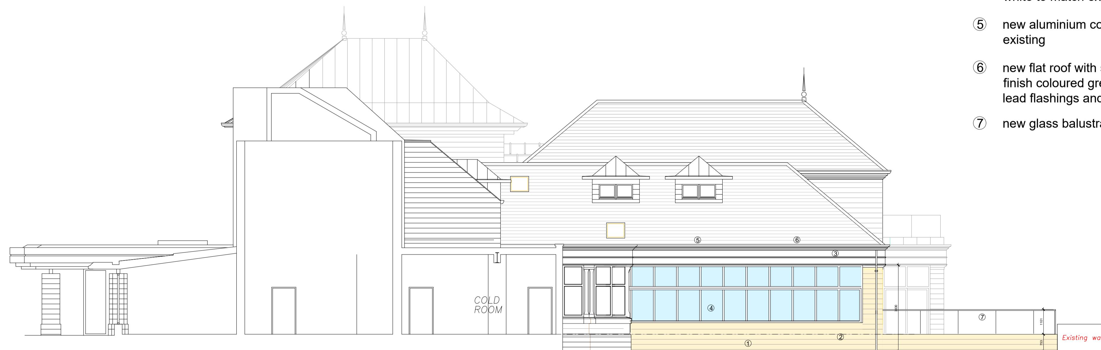
PROPOSED SECTIONAL NORTH ELEVATION