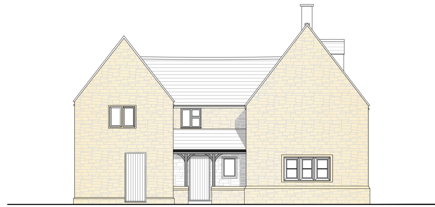
North Elevation - Existing scale 1:100