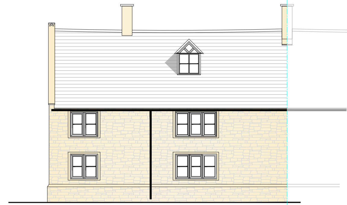
West Elevation - Existing scale 1:100