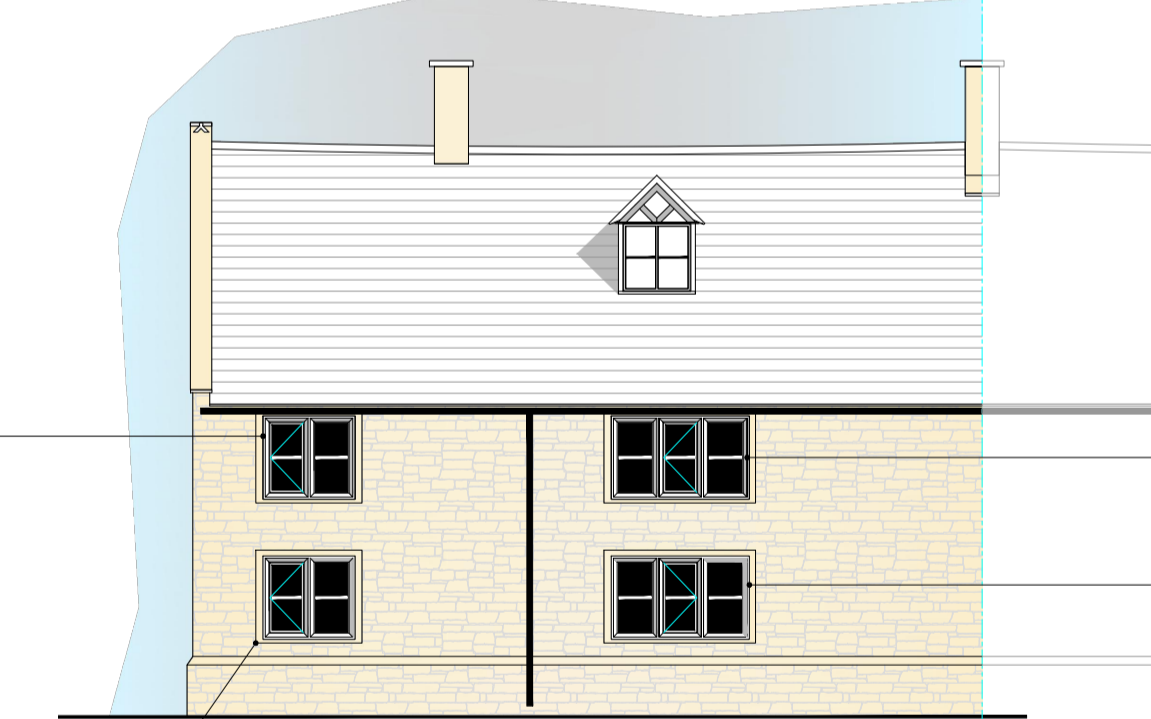
West Elevation - Proposed scale 1:100

SMA Alltherm Heritage windows within existing stone mullion window, coloured Creme to match existing units. Consisting of 2 nr. W20015 Outer frame bead and stay, with 1 nr. W20025 opening vent. Glazing consisting of 1 x 4mm clear and 4mm Low emissions toughened glass (double glazed). Horizontal glazing bar to each unit