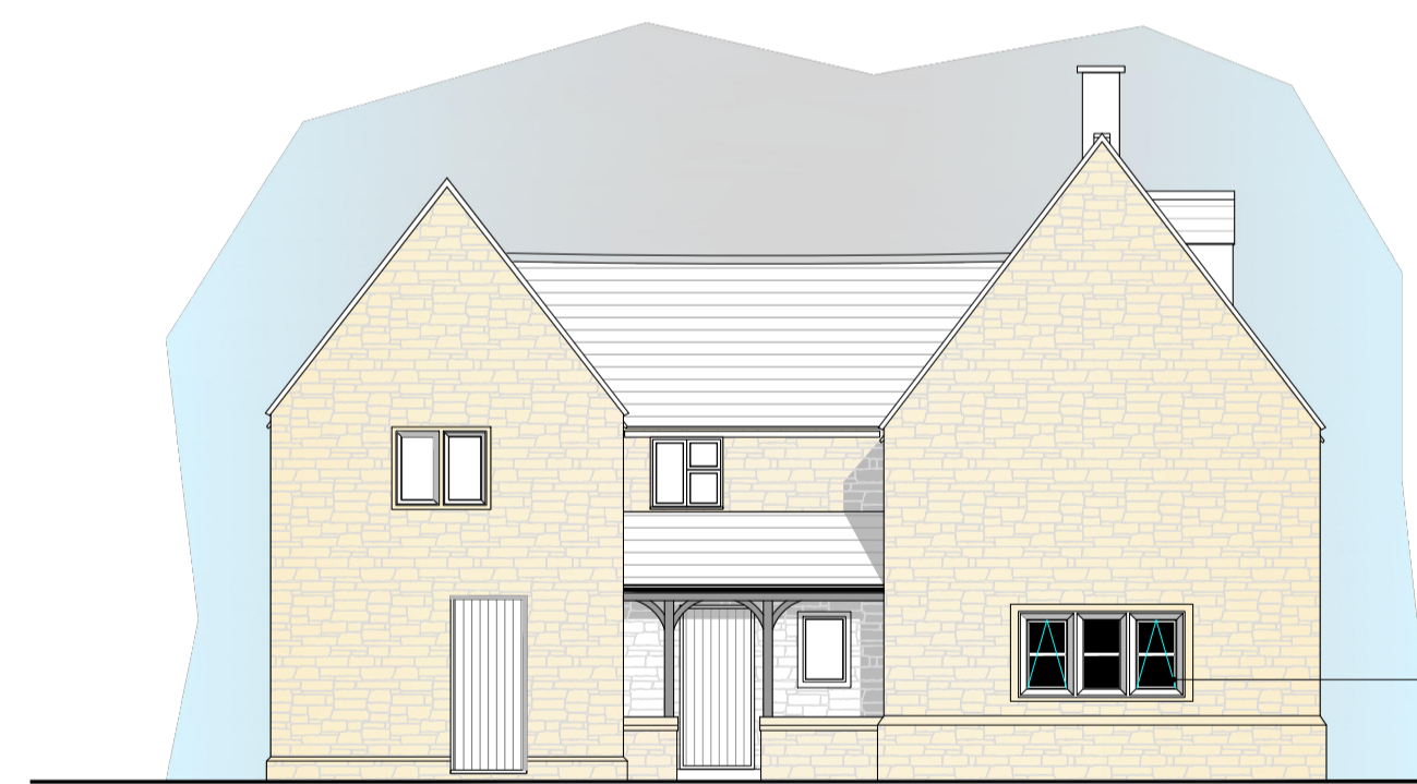
North Elevation - Proposed scale 1:100

SMA Alltherm Heritage windows within existing stone mullion window, coloured Creme to match existing units. Consisting of 2 nr. W20015 Outer frame bead and stay, with 1 nr. W20025 opening vent. Glazing consisting of 1 x 4mm clear and 4mm Low emissions toughened glass (double glazed). Horizontal glazing bar to each unit