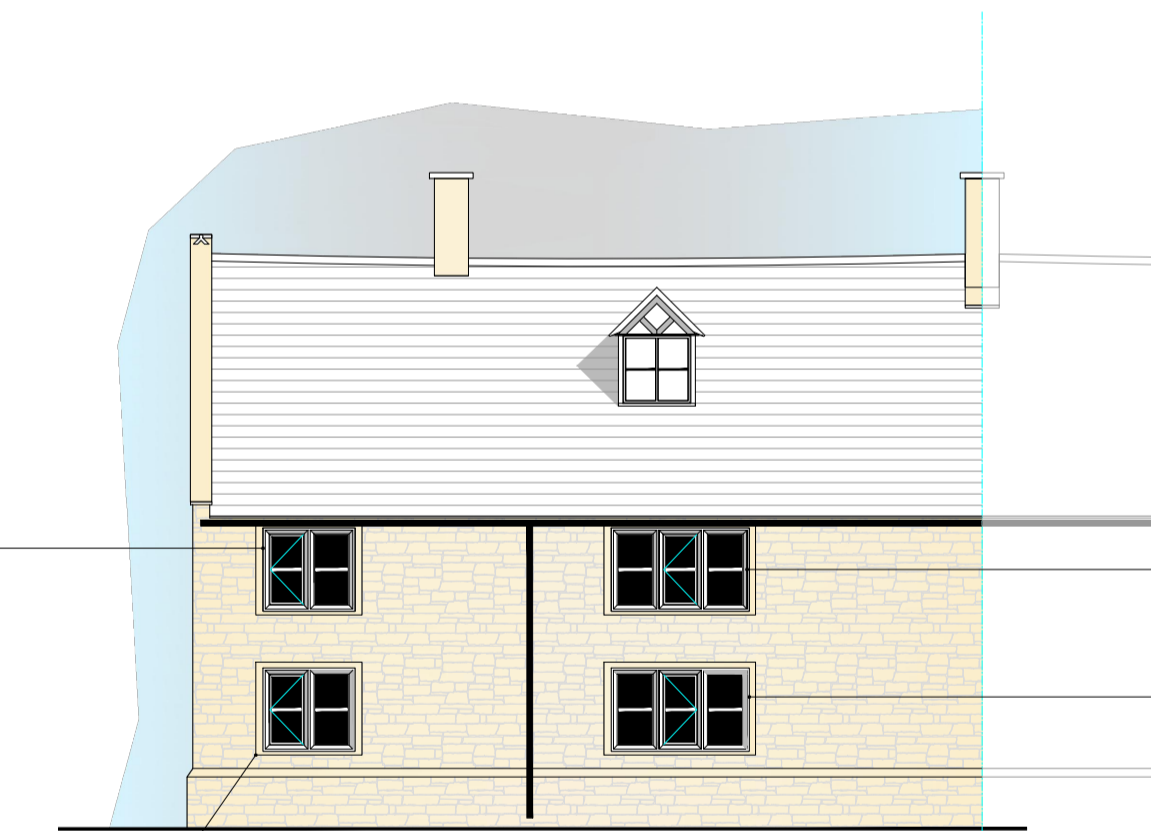
West Elevation - Proposed scale 1:100

SMA Alltherm Heritage windows within existing stone mullion window, coloured Creme to match existing units. Consisting of 2 nr. W20015 Outer frame bead and stay, with 1 nr. W20025 opening vent. Glazing consisting of 1 x 4mm clear and 4mm Low emissions toughened glass (double glazed). Horizontal glazing bar to each unit