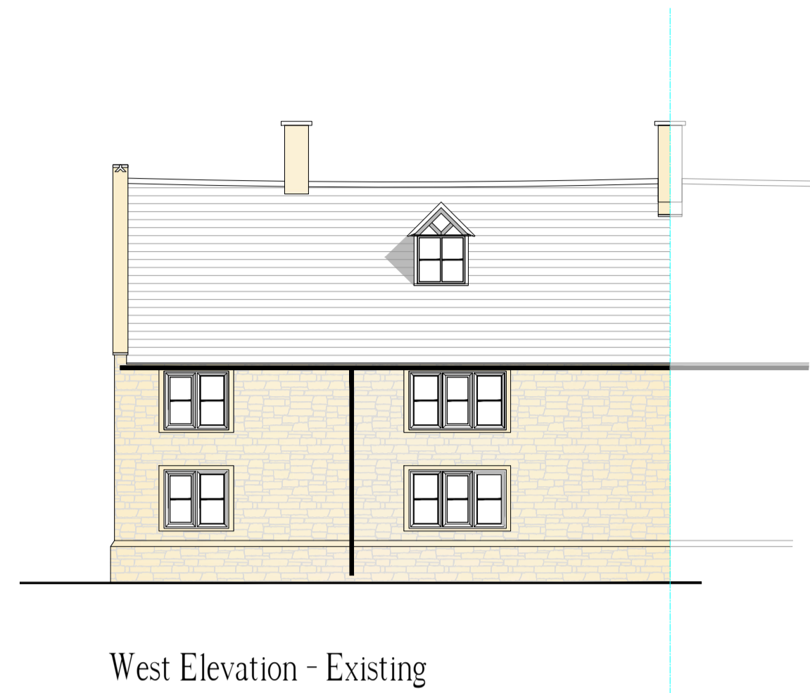
West Elevation - Existing scale 1:50