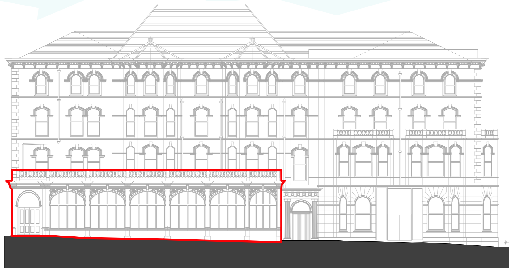
Elevation to Tablot Square