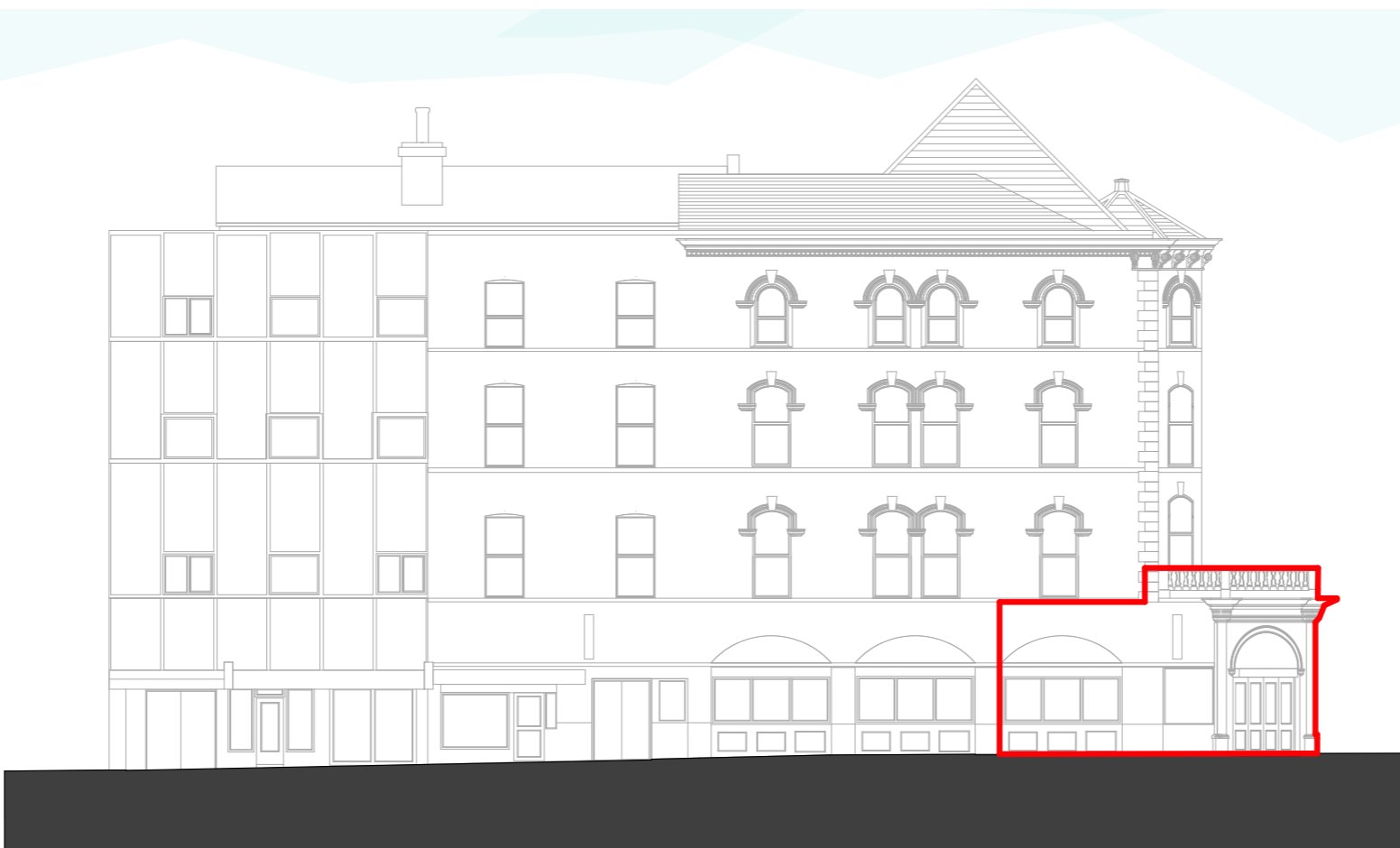
Elevation to Market Street