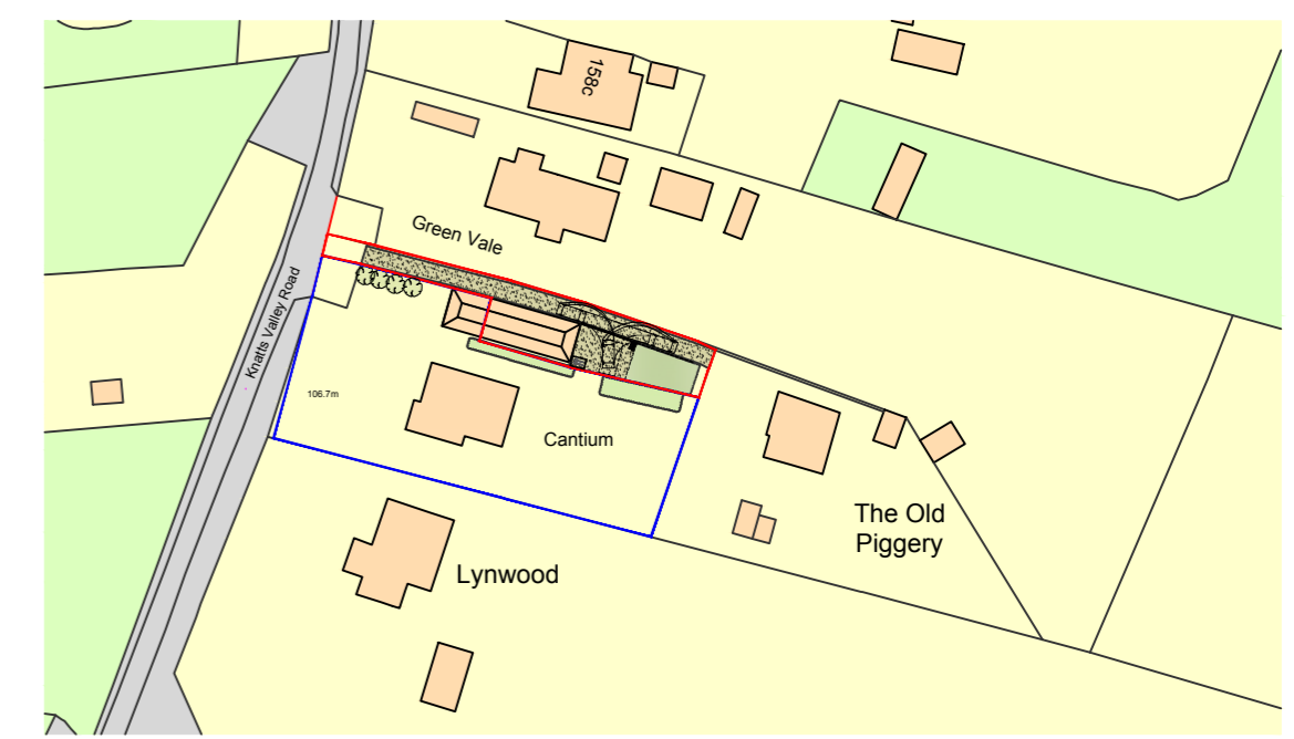
PROPOSED LOCATION PLAN Scale 1:1250