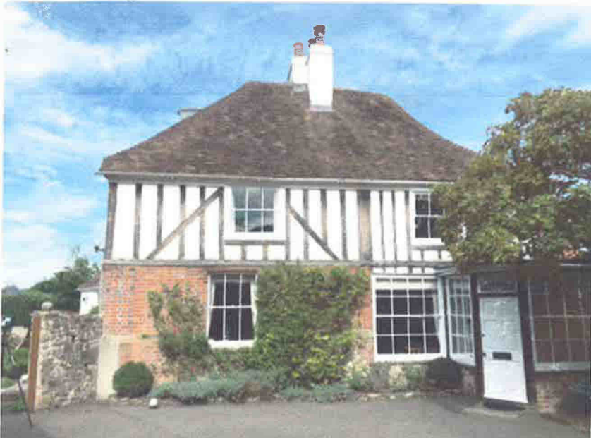
PHOTO OF EXISTING HOUSE

Bonding and pointing: Brushed back joints between the stone, random coursed stone, lime mortar, to match existing