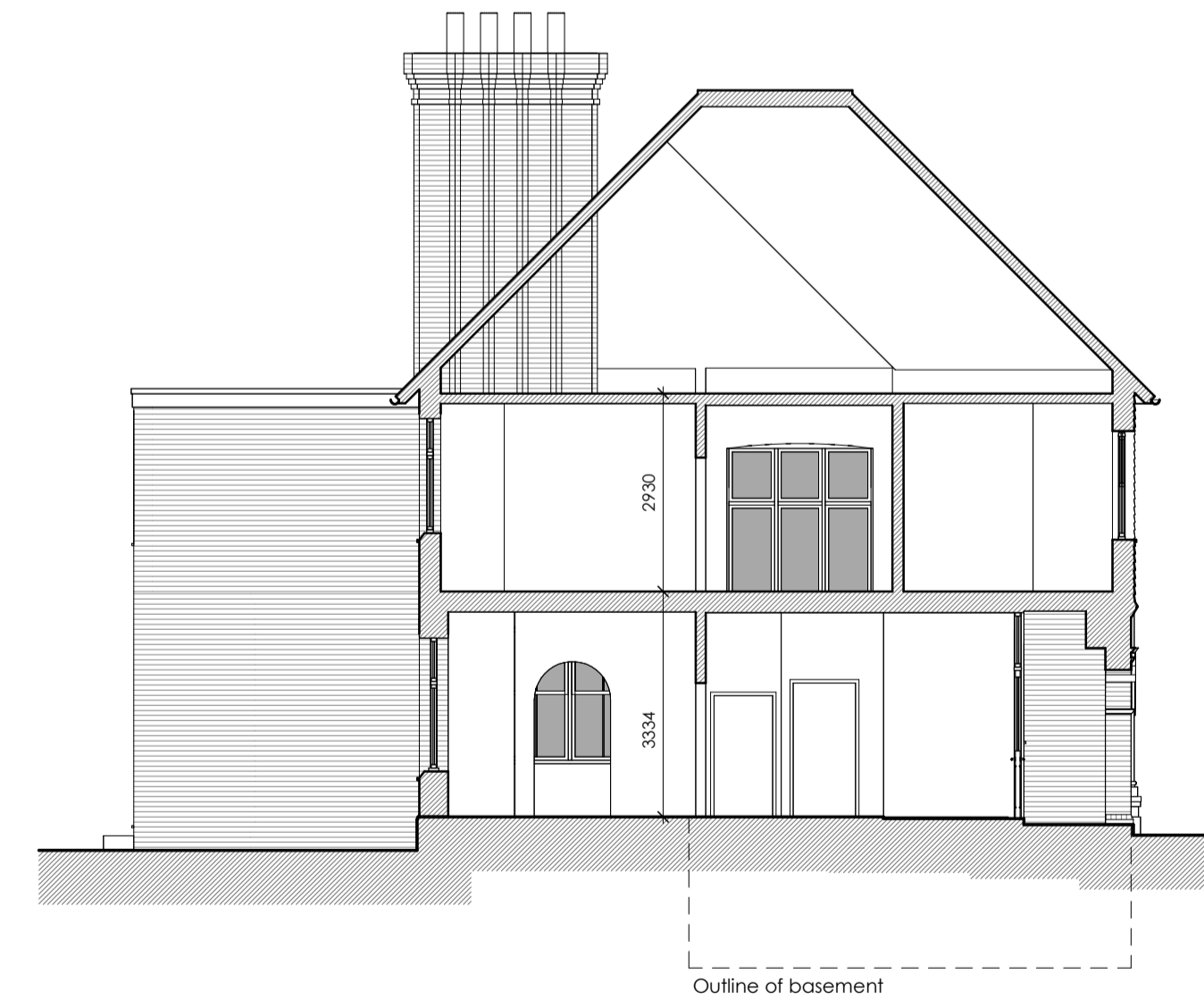
Indicative Building Section Scale 1:100