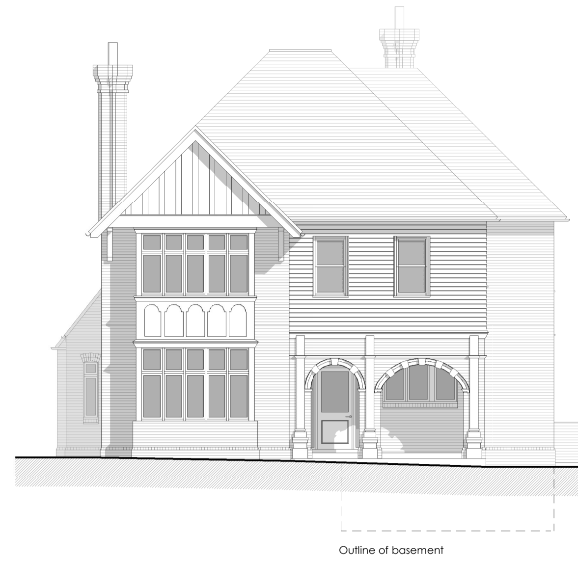
Front Elevation (East Facing) Scale 1:100