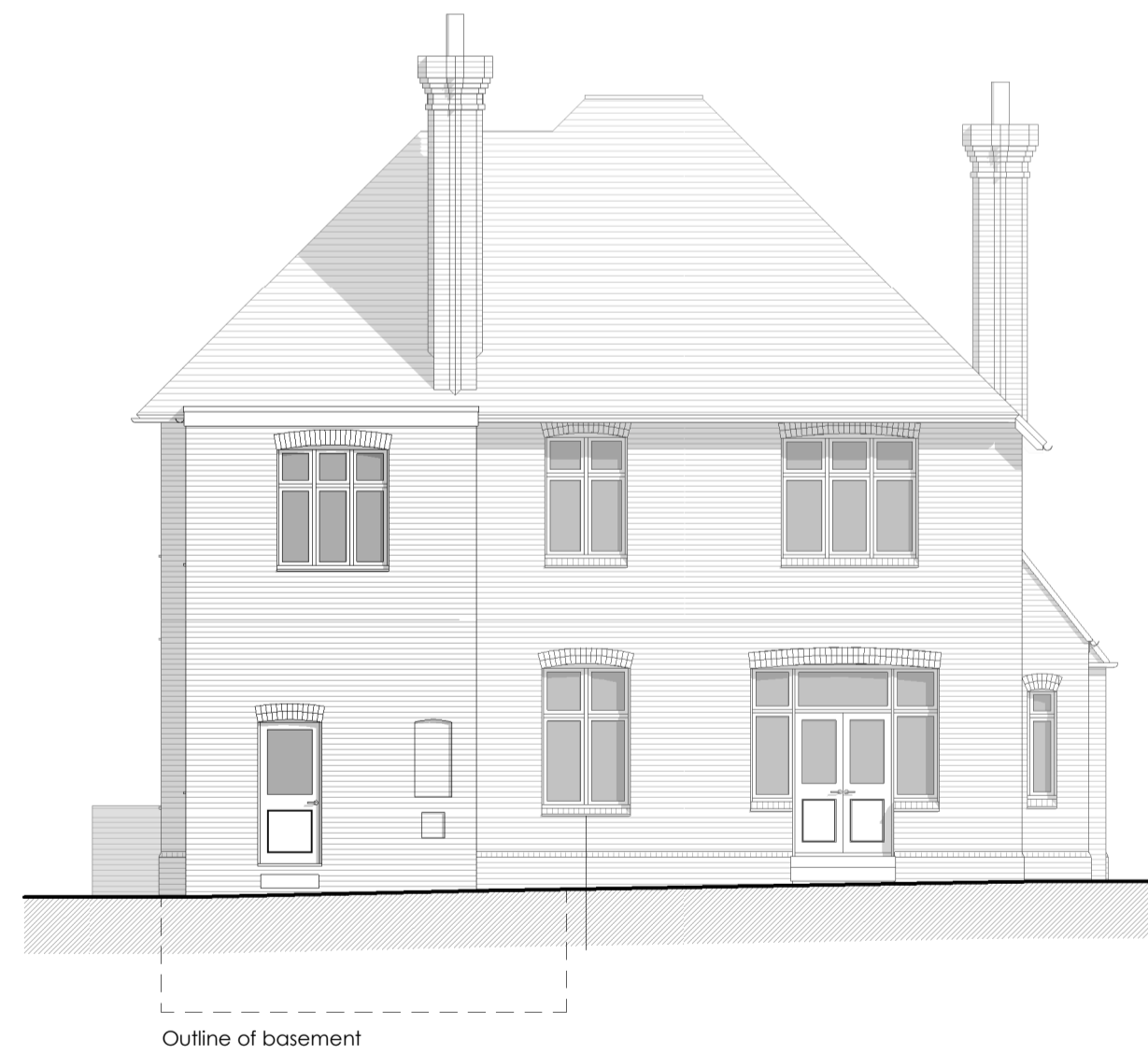
Rear Elevation (West Facing) Scale 1:100