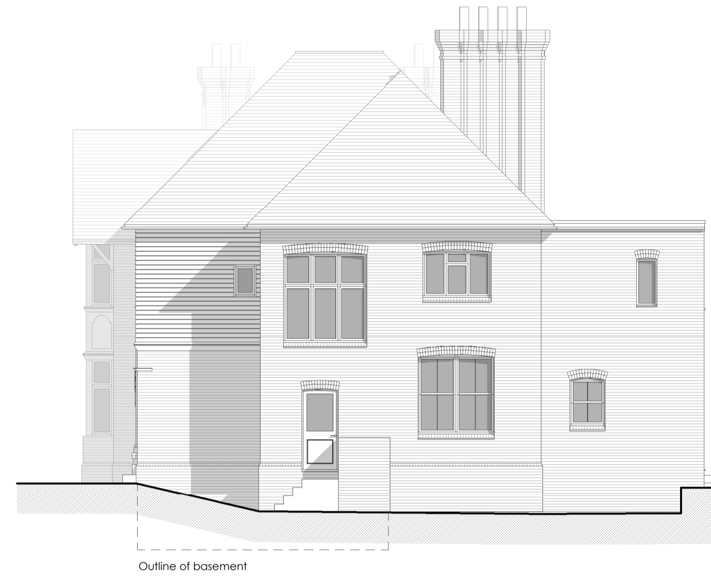
Right Flank Elevation (North Facing) Scale 1:100