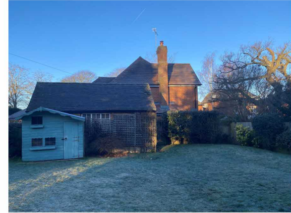
Photo 3 , Photograph of the existing detached garage and shed, these being located to the rear of the property.