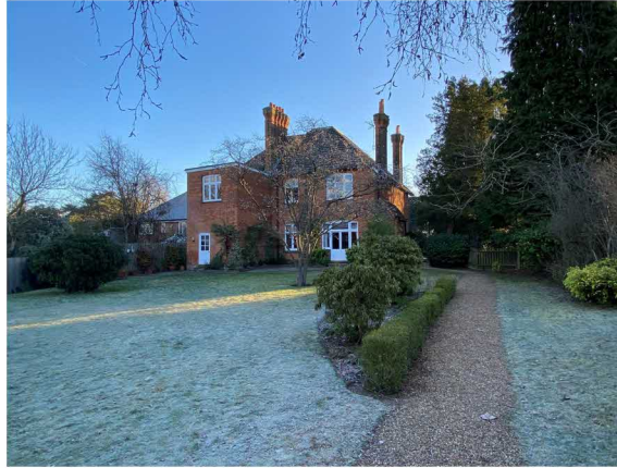
Photo 2 , Photograph showing the rear of the property.