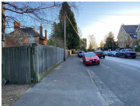
Photo 5 , Photo looking down Avenue Road. Note how the close board fencing is of no real quality and has a tired appearance.