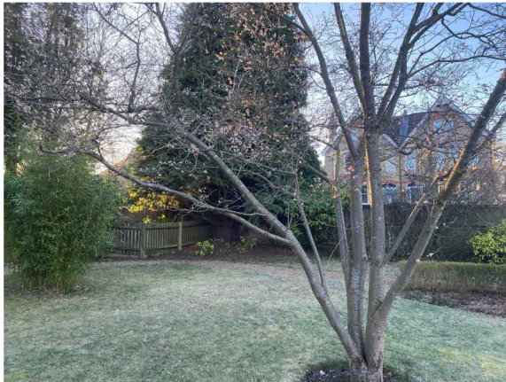
Photo 4 , Photograph looking towards the southern boundary with its close board fence.