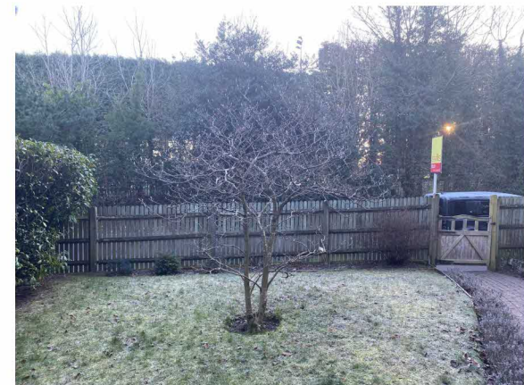
Photo 6 , Photo looking towards the existing front, east facing boundary, as seen from the entrance porch.