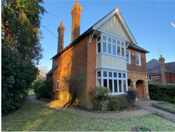
Photo 1 , Photograph looking towards the front of the building as seen from the front garden.