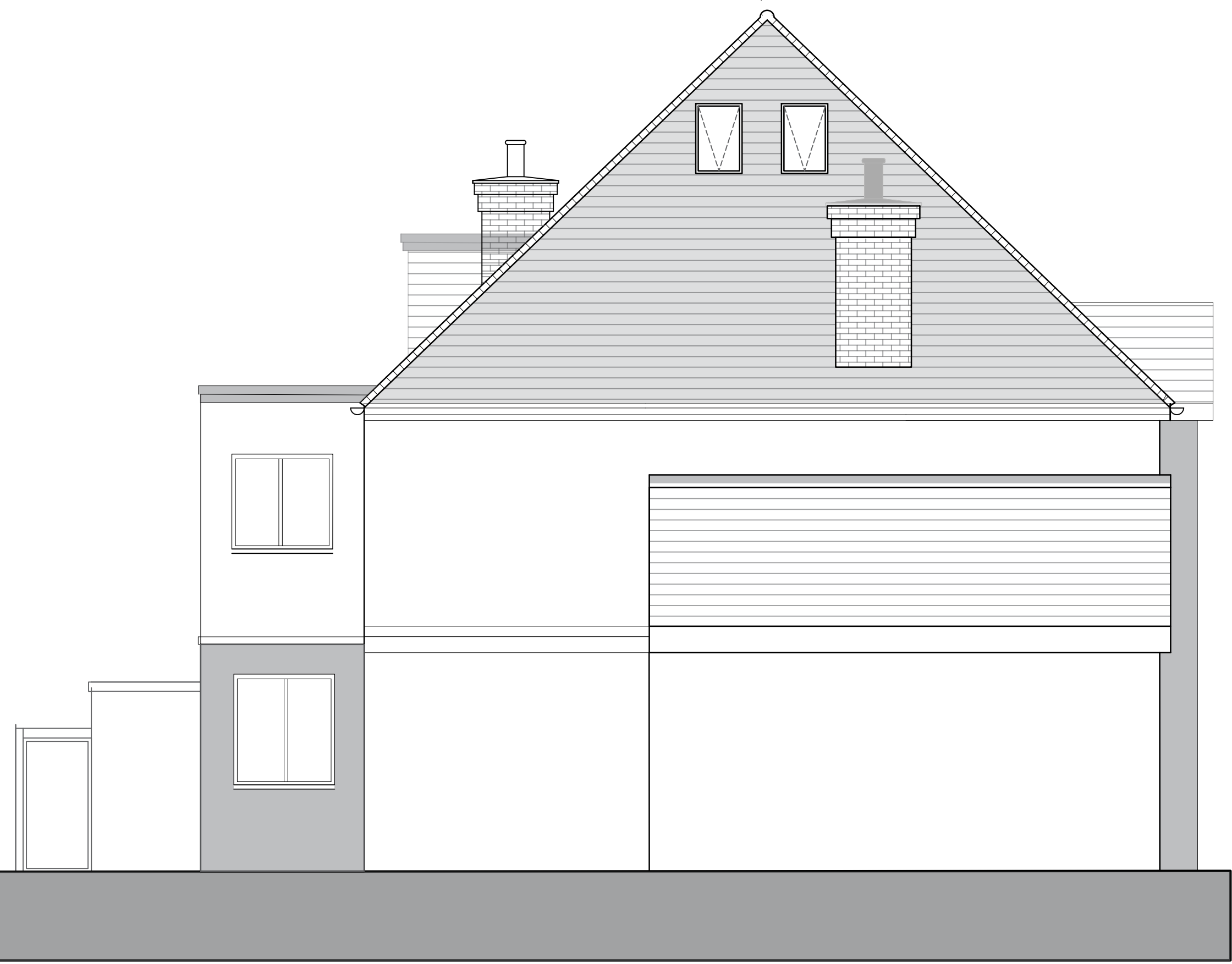
LEFT SIDE ELEVATION SCALE 1 :50