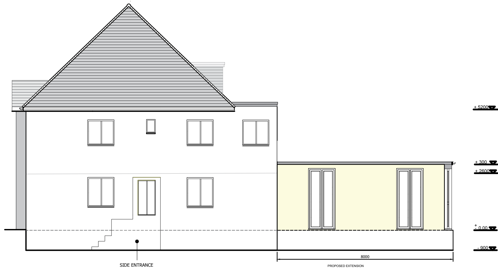
RIGHT SIDE ELEVATION SCALE 1 : 100