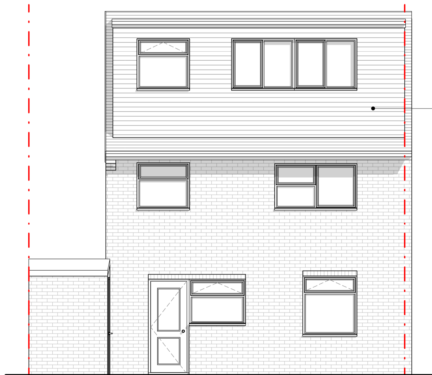
3 Proposed_North 1 : 50