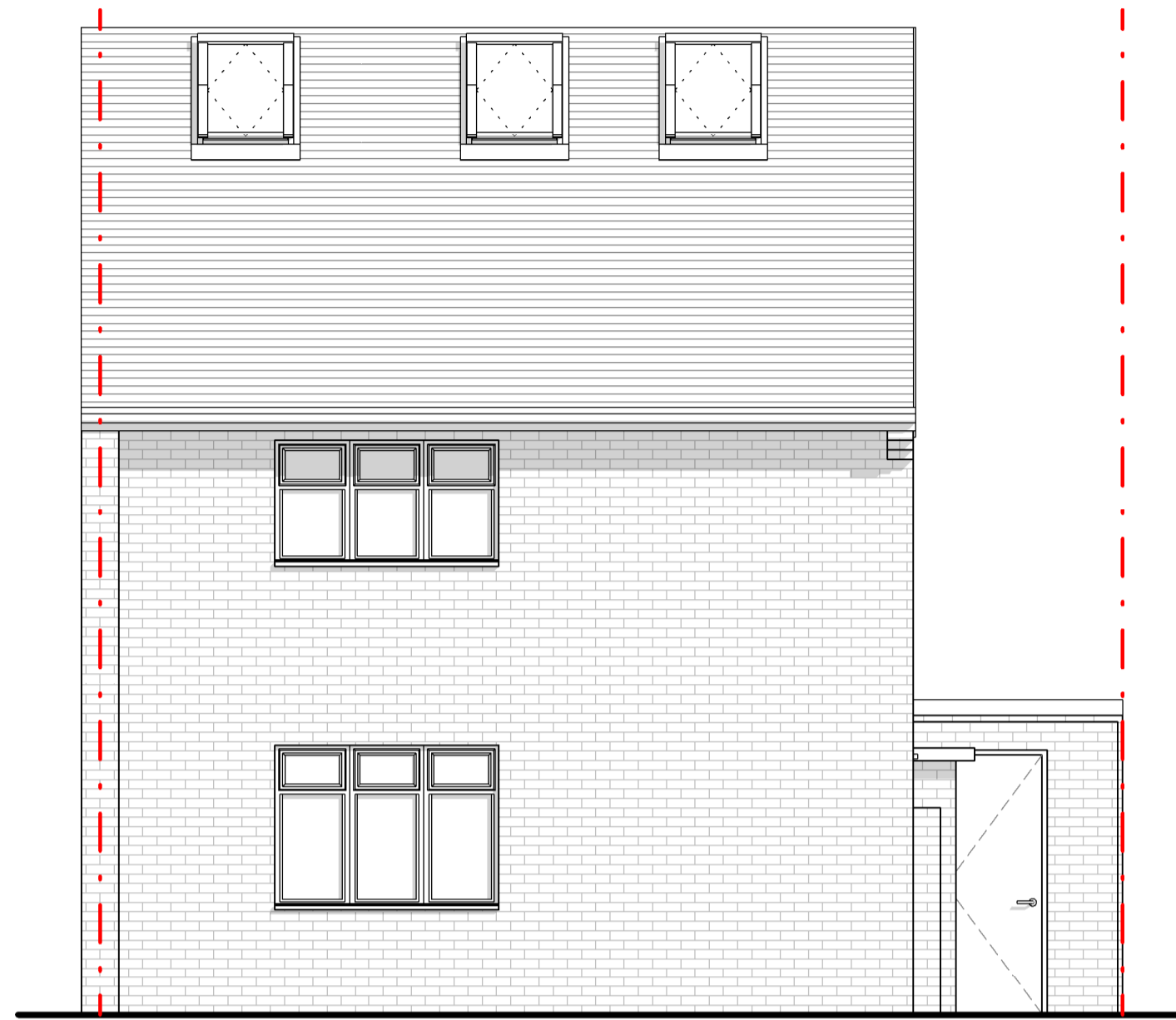
1 Proposed_South 1 : 50