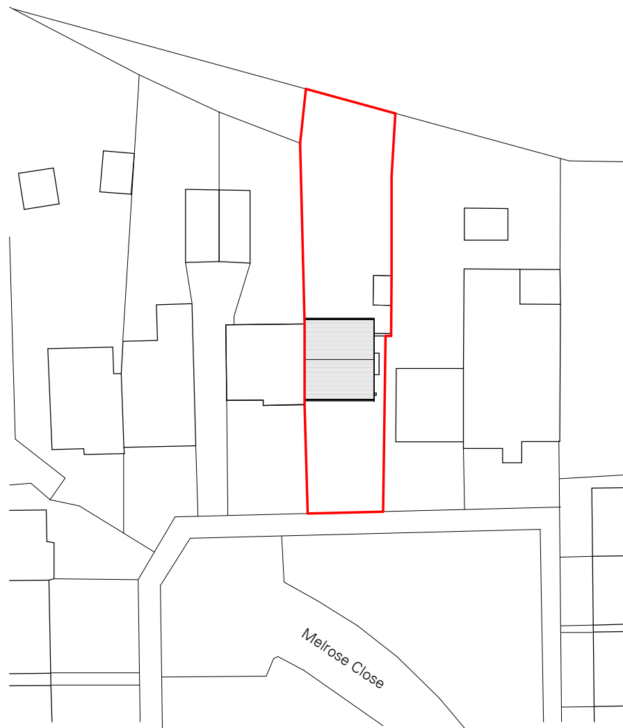
1 Site Plan_Existing 1 : 500