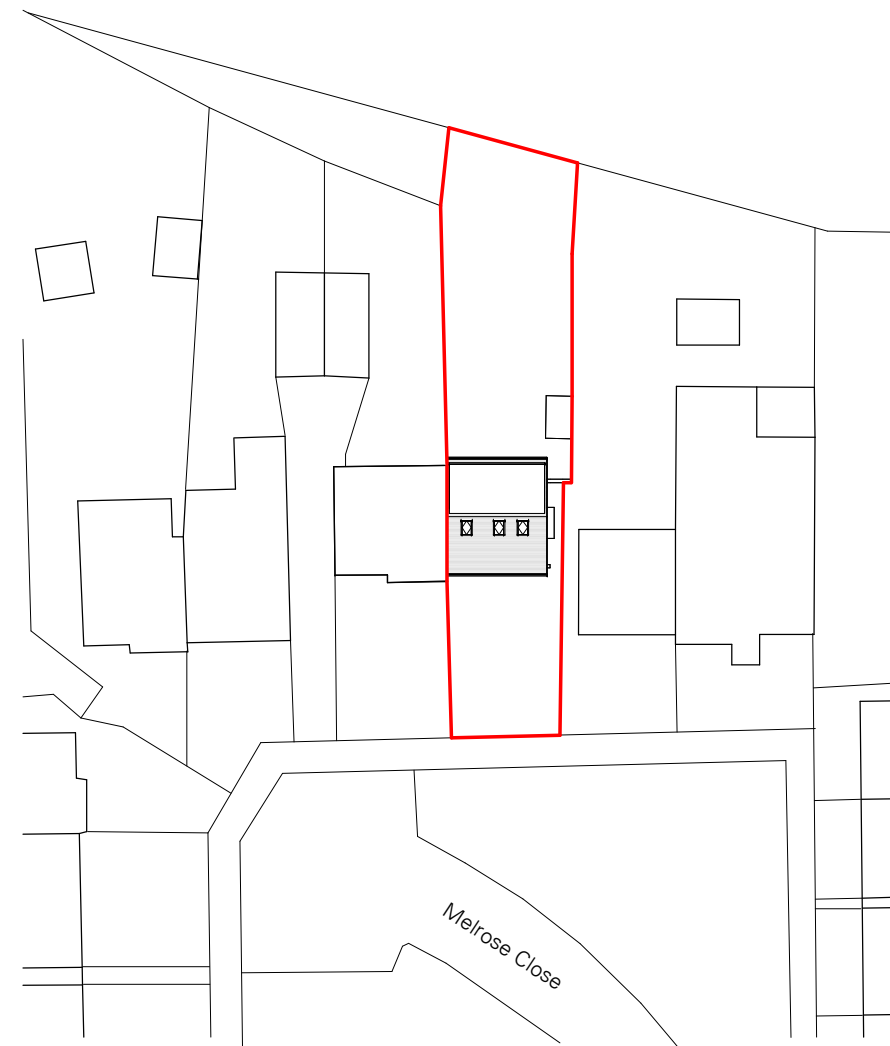
2 Site Plan_Proposed 1 : 500