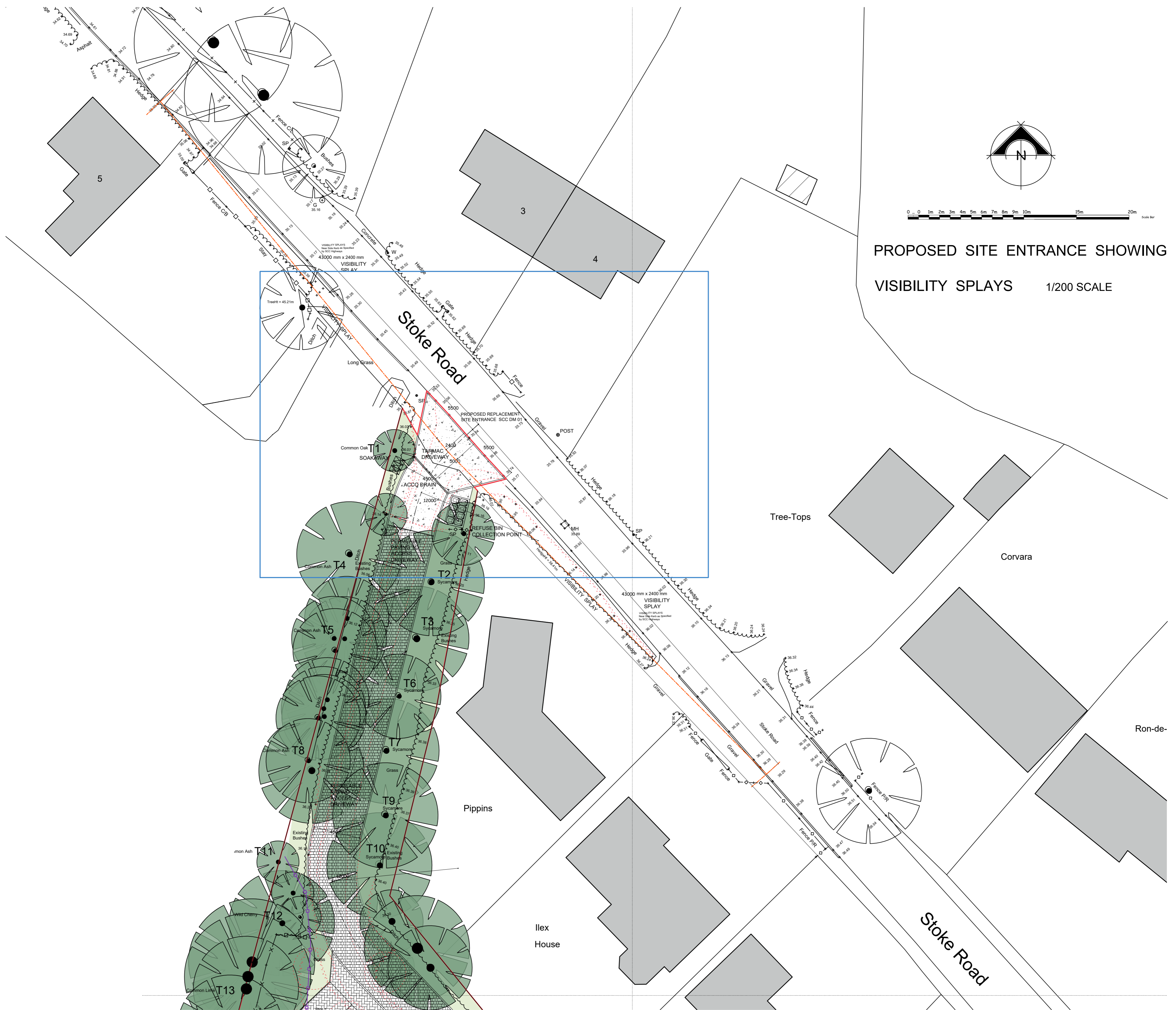
PROPOSED SITE ENTRANCE SHOWING VISIBILITY SPLAYS 1/200 SCALE