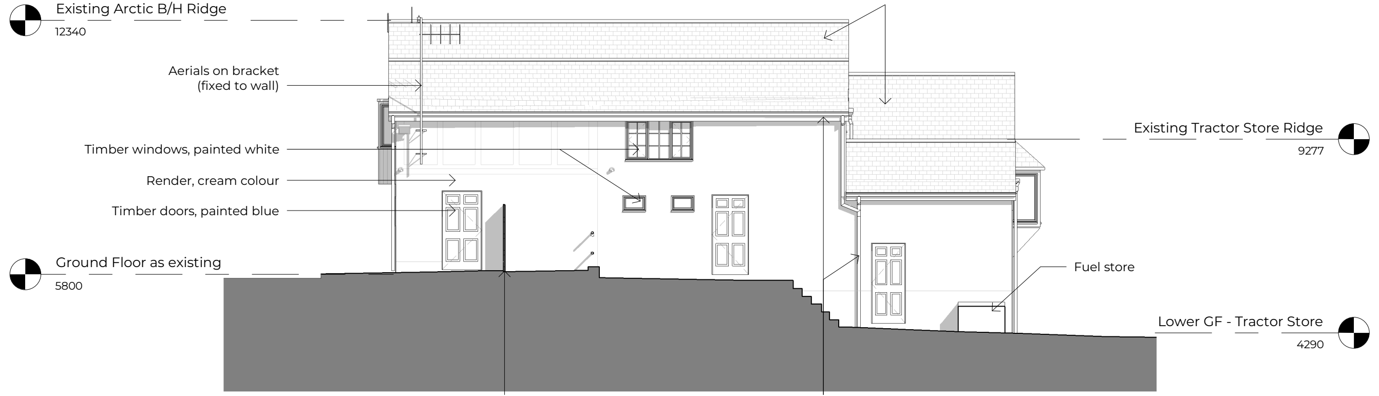
East Elevation - existing 1:100