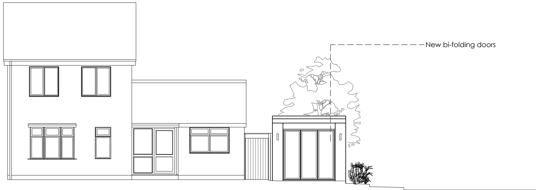
Proposed Southwest Elevation (A) scale 1:100@A3