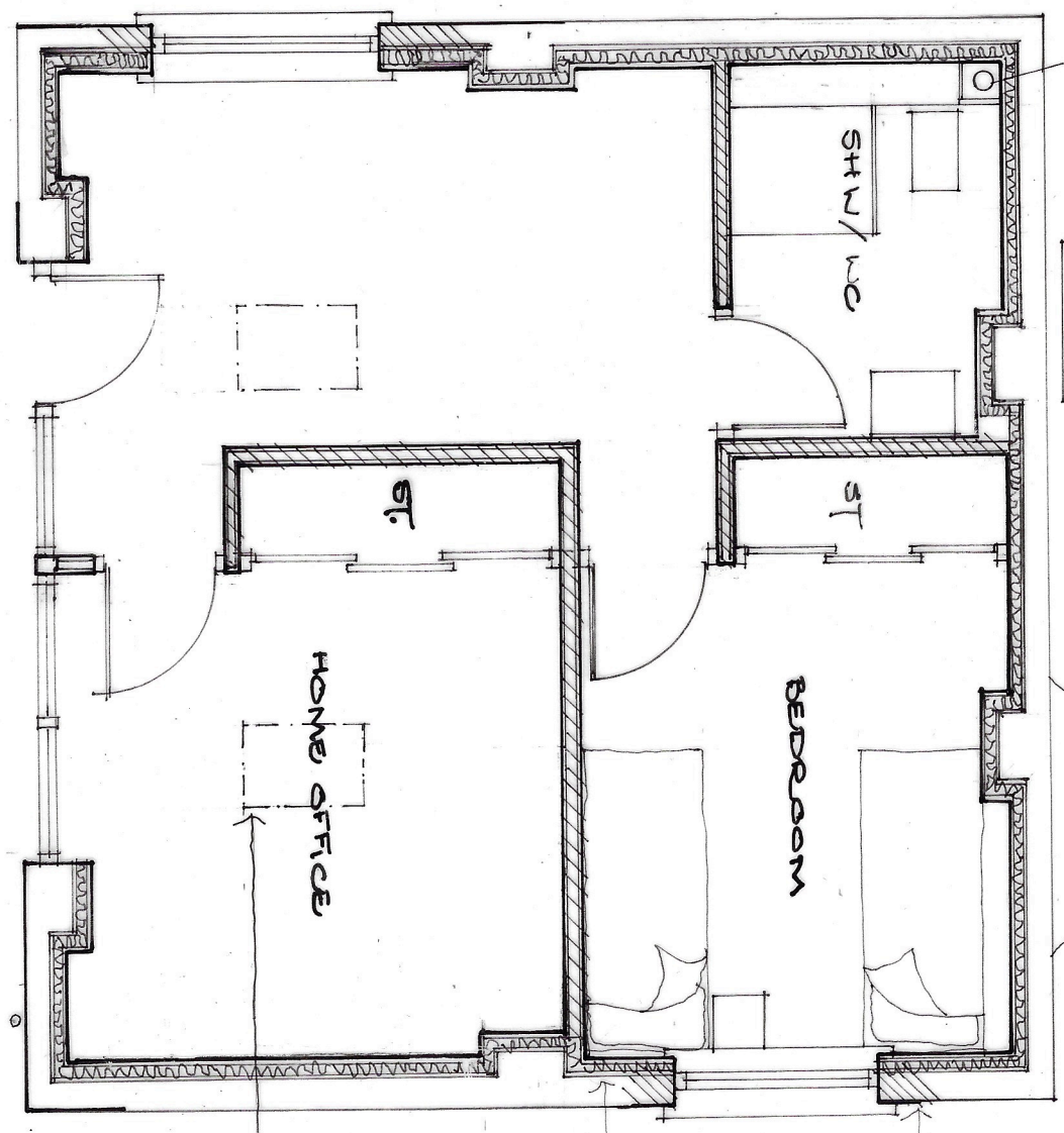
PROPOSED FLOOR PLAN 1:50